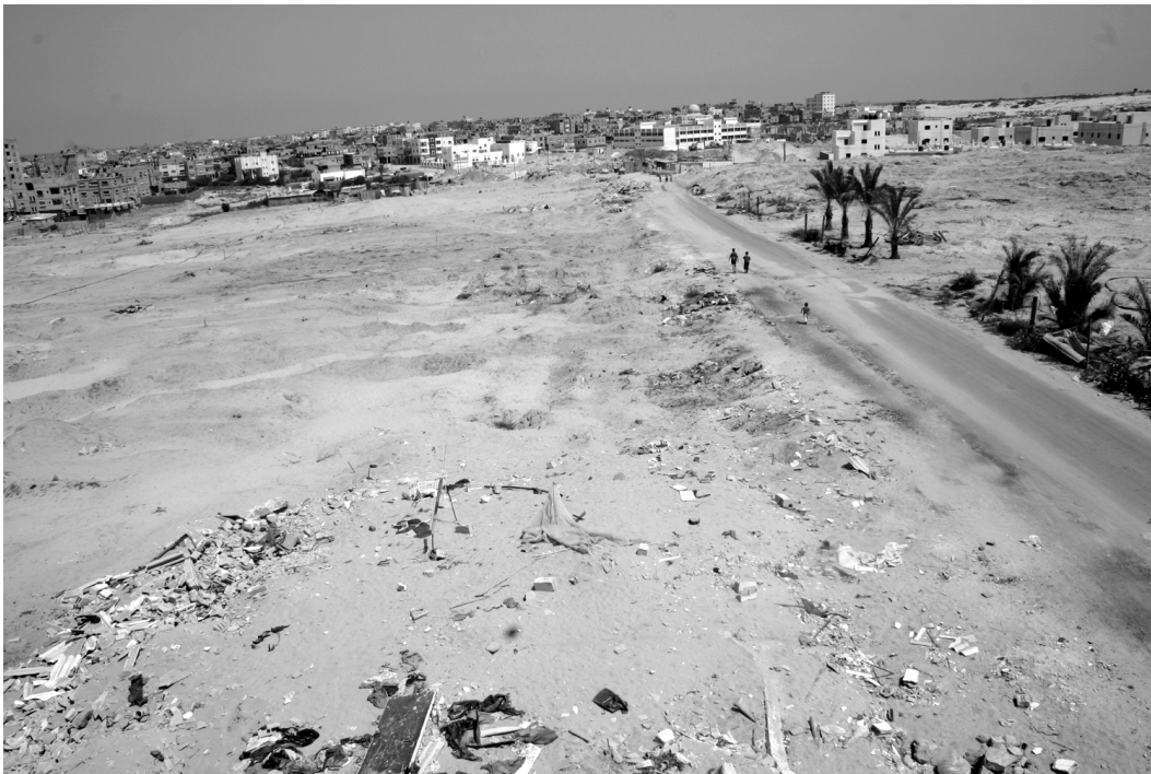
A barren wasteland is all that remains of nearly 30 hectares of agricultural land that had been filled with greenhouses containing fruit, flowers, and vegetables before it was destroyed by the IDF.

Satellite imagery shows the areas of greenhouses replaced by barren land. Human Rights Watch researchers visited both plots, now filled with dirt mounds and crumpled metal frames. Both areas are more than one kilometer away from the border and not near any Jewish settlements.