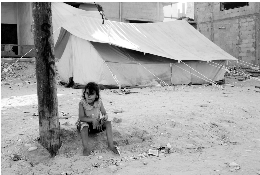
A family from the Brazil neighborhood still lives in a tent two months after Operation Rainbow.

Local and international organizations report growing problems with physical and mental health linked to violence, overcrowding, and widespread poverty in the Gaza Strip. After years of de-development and forced dependency on Israeli hospitals, Gaza health facilities are severely under-equipped. Hospitals suffer regular interruptions in access to clean water, electricity, and basic medical supplies that negatively affect clinical services, sanitation, and the prevalence of infectious disease. Access to hospitals by patients is also greatly diminished by severe restrictions on freedom of movement. 50