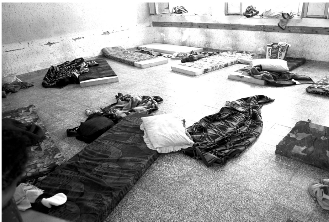
A Rafah family's sleeping room at a UN school in July, two months after the IDF destroyed 298 homes. Rafah is one of the most densely populated towns in the world, and housing is in short supply.

In the aftermath of the May incursions, documented in detail below, UNRWA temporarily housed approximately two thousand five hundred people in three of its schools, with up to fifty people in one room. That number dwindled as families found alternative housing with relatives, rented new homes or occupied empty spaces in town, but UNRWA noticed a “relatively slow movement” out of their schools, indicating a saturation of the housing market. 172