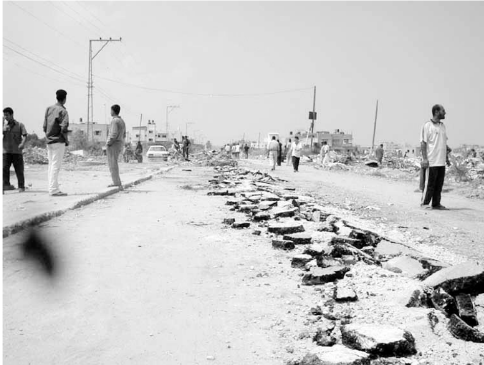
A road in Beit Hanoun, northern Gaza Strip, destroyed by the rear blade known as the "ripper" of a CAT armored bulldozer, deployed by the IDF.

Damage to the water system affected a water network that, according to UNDP and the Palestinian Ministry of Planning, was already “old, worn and polluted.” 268 According to the Rafah Municipality, thirty-six out of fifty-five kilometers of water pipes were damaged in the neighborhoods of Tel al-Sultan, Brazil and Salam. Twenty-seven out of thirty-five kilometers of sewage pipes were damaged in the same area. 269