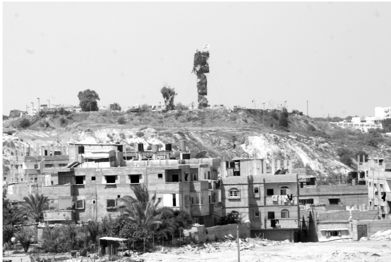
An IDF watchtower on the Gaza-Egypt border, overlooking the neighborhood Tel al-Sultan.

The Egypt-Gaza border is 12.5 kilometers long, of which four kilometers run alongside Rafah. According to the IDF, “Rafah and the Philadelphi route is the most dangerous, violent area of the whole conflict.” 82 An IDF spokesman for the Southern Command told Human Rights Watch that sixty to seventy percent of all Palestinian attacks in the conflict occur in the southern zone. 83 Due to its border location, Rafah is also the main area for smuggling tunnels – called “arteries of terror,” by the IDF – that supply Palestinian militants with arms and ammunition.