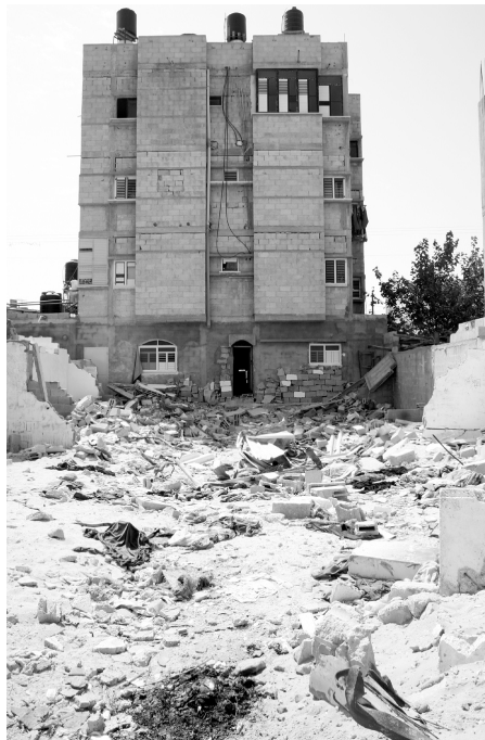
The IDF destroyed the Mehsin family home, rubble in foreground, to clear a path to the three-story building owned by Sameer Barud. They stayed for four days, holding thirty family members in one room.

Human Rights Watch saw the small room on the second floor in which the family — six men, five women and nineteen children — was held. Behind the house, to the west, were the mangled remains of the Mehsin family house that the IDF had destroyed to avoid approaching Sameer Barud's building from the front. The family was not aware what the IDF was doing in their house for four days, but they learned later that snipers had been positioned on their roof, with a view over the mosque and the open space to its north. According to one media report, soldiers used Sameer Barud as a human shield, forcing him to go downstairs to check for Palestinian militants. 230 When the soldiers left the house after four days, the family discovered broken windows, doors and furniture.