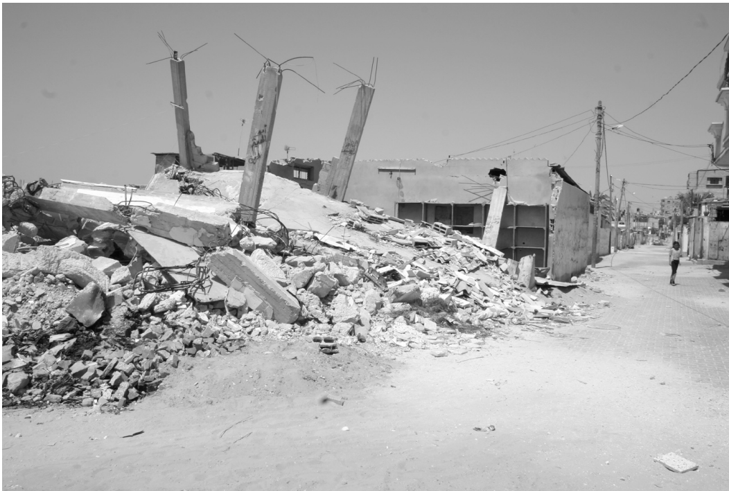
The IDF destroyed this Block J house, residents unknown, in May 2004.

Equally important to Israel was the Jordan Valley, on the external border of the West Bank. While up to a quarter of the population of the West Bank left after the war, the Jordan Valley's population fell by eighty-eight percent, to 10,778. In subsequent years, the population grew to some twenty thousand. 73 The bulk of those who fled across the river to Jordan were fifty thousand refugees living in three large camps in the valley – 'Ein al-Sultan, Nu'aymah, and 'Aqbat Jabir. According to the International Committee of the Red Cross, the IDF bulldozed the Jordan Valley communities of Jiftlik, Ajarish, and Nuseirat in late 1967. 74 Israel's first settlements in the OPT were also in the Jordan Valley, underlining the importance given by Israel to control over the external borders of occupied territories.