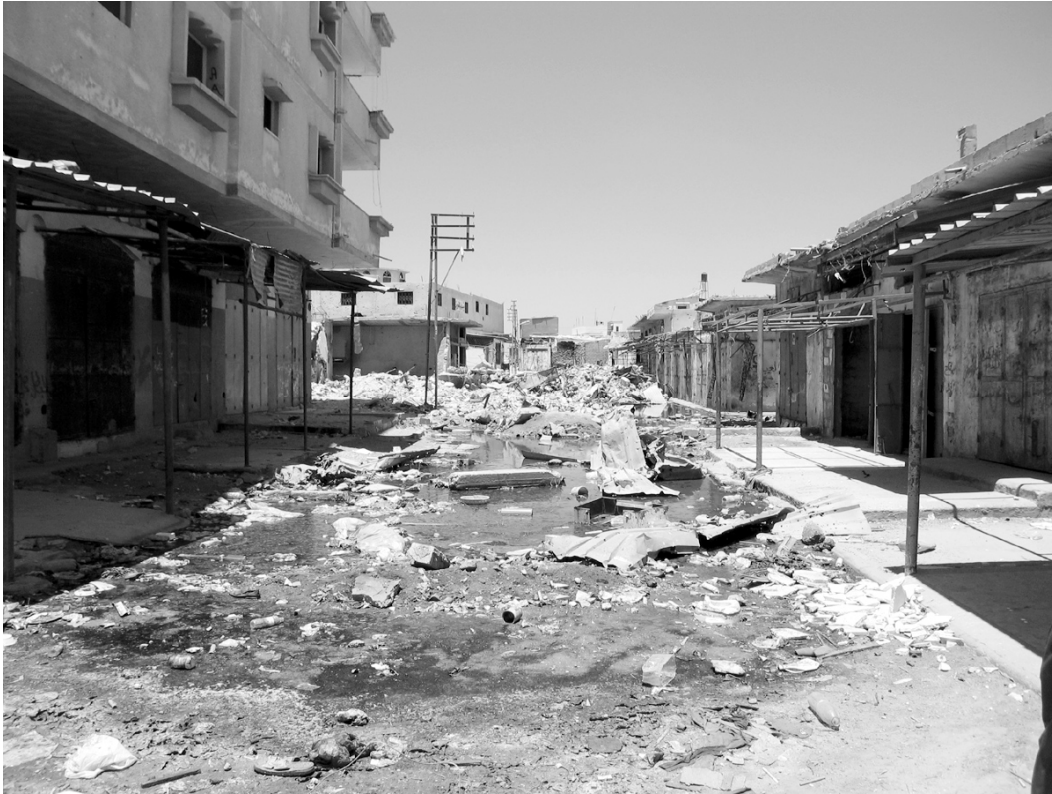
Drinking and sewage water mix in Block O after IDF forces destroyed roads and pipes during May.

IDF tanks and bulldozers also caused extensive damage to the electrical grid, breaking electricity poles, cutting wires and destroying transformers. According to the Gaza Electrical Distribution Company (GEDCO), the cost of damage to the electrical infrastructure was U.S. $150,005. This destruction comes on top of repeated damage over the past four years. The GEDCO transformer near Salah al-Din gate, for example, has been damaged or destroyed eight times since September 2000. 272