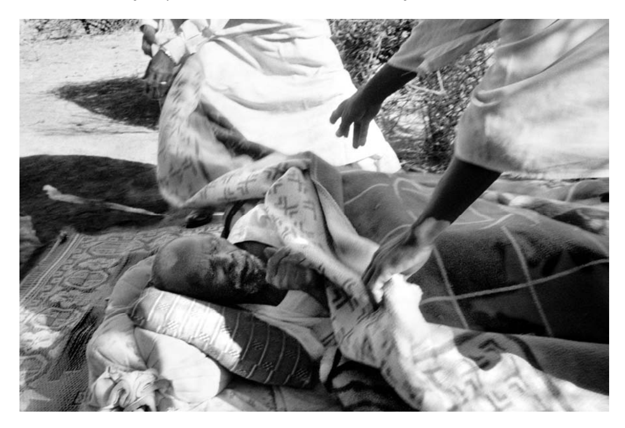
Refugees rest after walking 34 days to reach neighboring Chad.