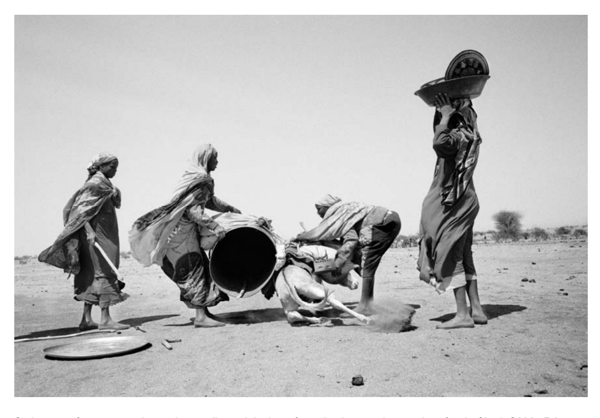
Sudanese refugees struggle to raise a collapsed donkey after a 34-day march towards safety in Chad.