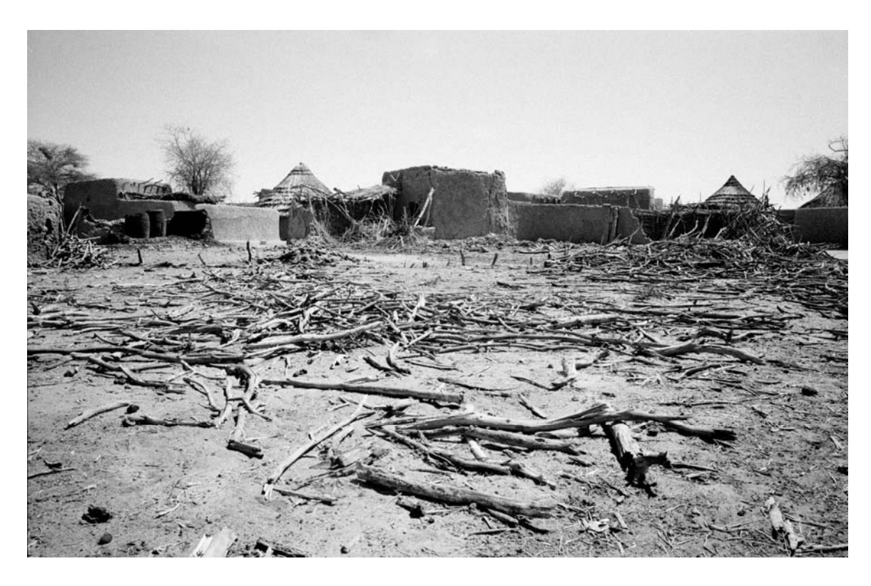
The remains of the village of Jijira Adi Abbe in Darfur, western Sudan, after the government attack.