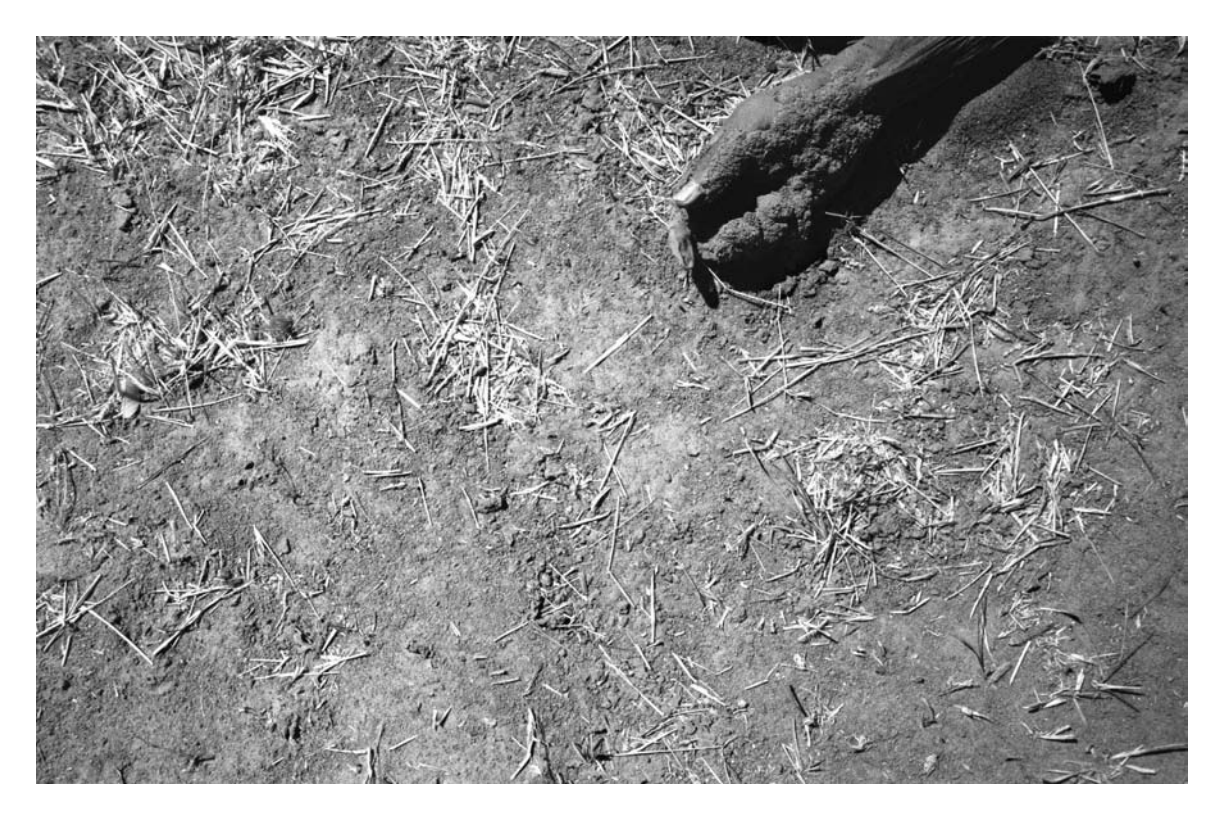
A body left unburied outside Jijira Adi Abbe in Darfur, western Sudan, after a government attack.