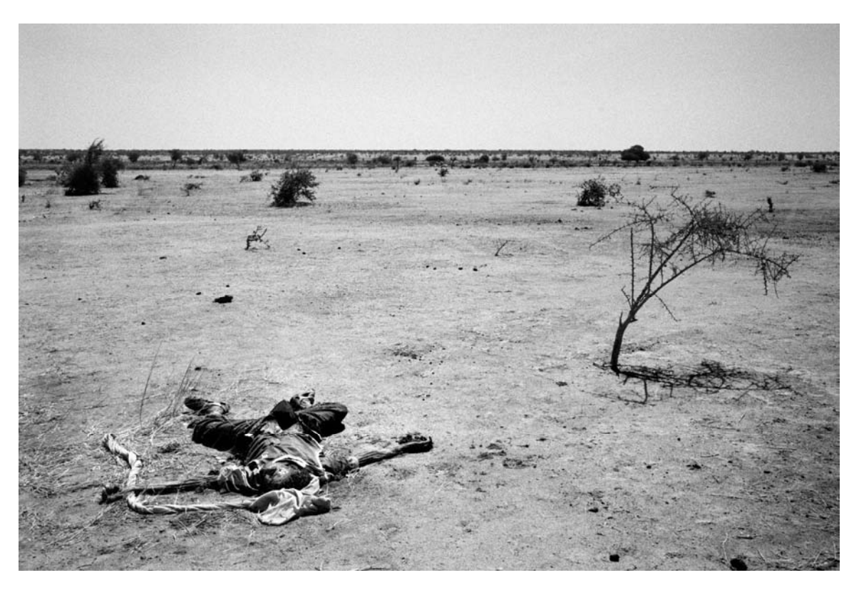
The body of a teenage boy lies among others outside the African village of Jijira Adi Abbe in Darfur, western Sudan. Bodies left unburied send a message to villagers elsewhere not to resist.