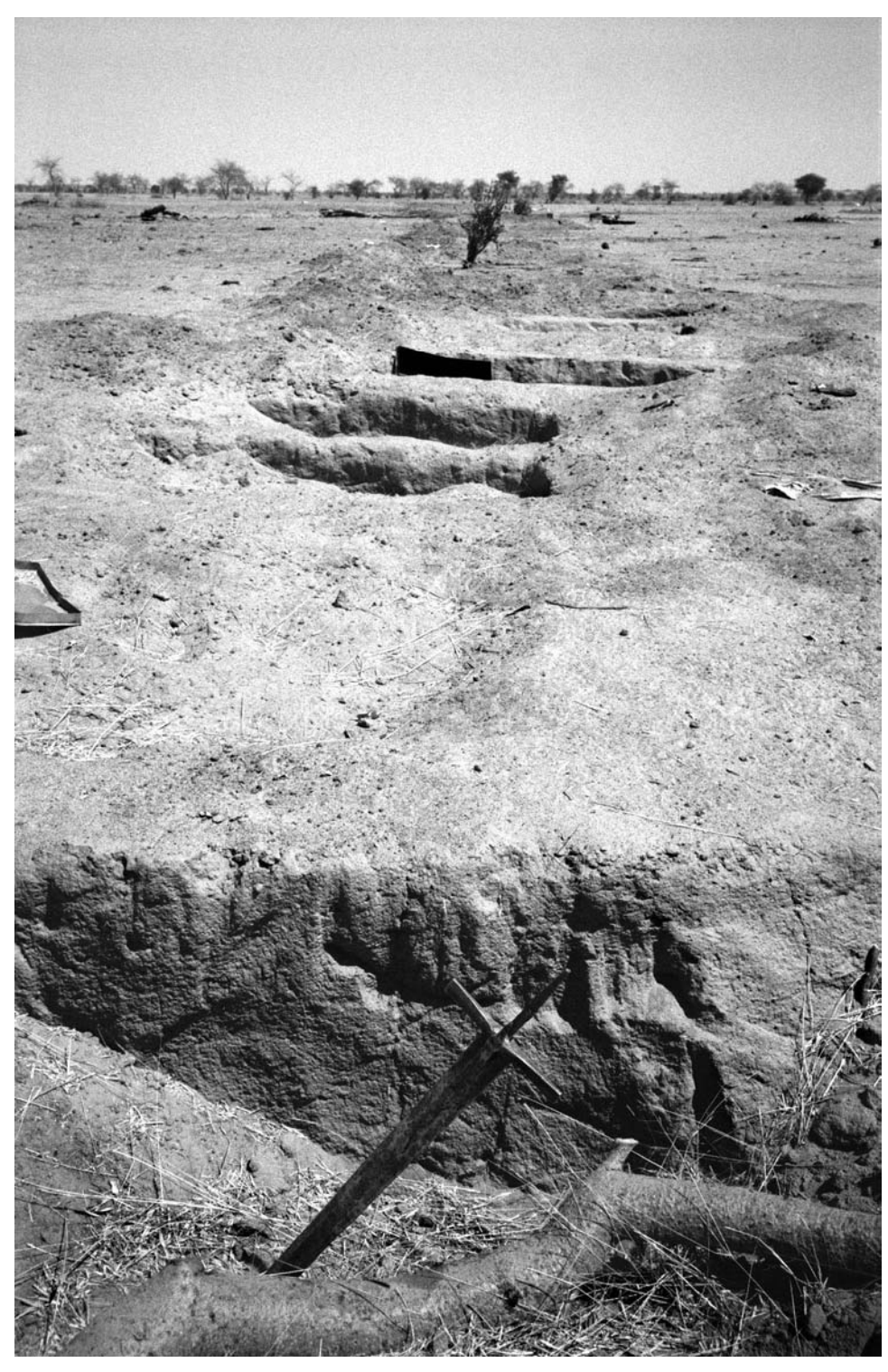
Graves outside the village of Jijira Adi Abbe in Darfur, western Sudan, after the government attack.