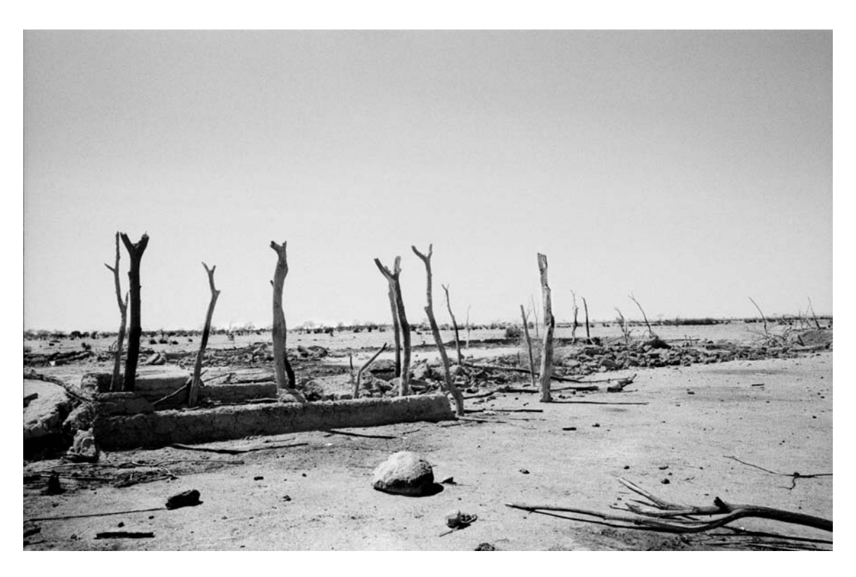
The remains of the village of Jijira Adi Abbe in Darfur, western Sudan after the government attack.