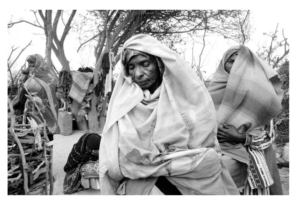
Sudanese refugees from Darfur arrive in Chad. The Sudanese government and allied militias are using a campaign of murder, rape, destruction and terror against civilians of the same ethnic groups as the rebel groups in western Sudan.