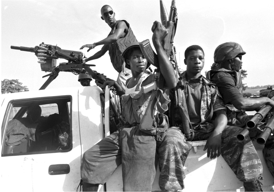
Rebels from the Revolutionary United Front (RUF) and Armed Forces Revolutionary Council [AFRC] patrol through the streets of Freetown, Sierra Leone shortly after a coup in May 1997 which overthrew democratically elected president Tejan Kabbah. Many Liberian fighters joined up with the joint RUF/AFRC forces during their nine months in power.