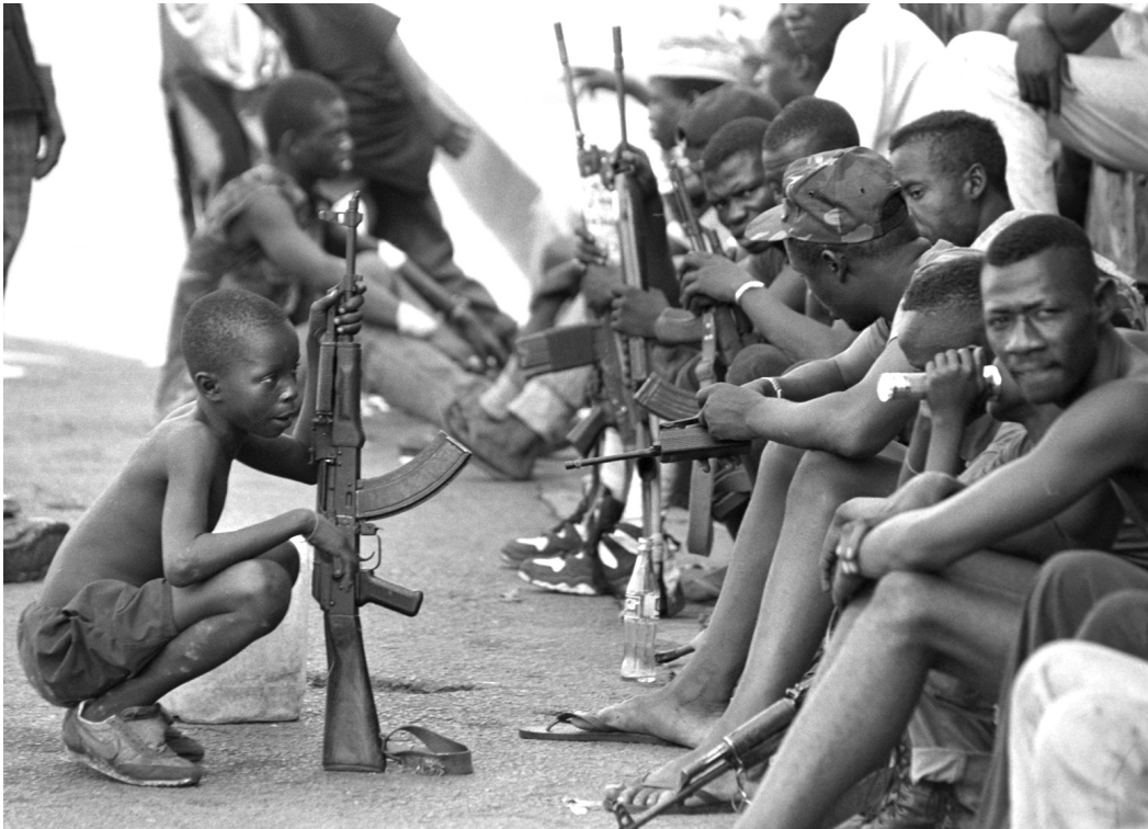
Young fighters with the National Patriotic Front of Liberia (NPFL) sit on a street corner during a lull in the fighting in April 1996. Many fighters from Sierra Leone fought in Liberia both with the NPFL and, after 1997 when NPFL leader Charles Taylor became president, as Liberian government militias.

Those defending the policy noted that the payment of TSA to children and its attendant financial motivations for the family, may have actually contributed to a “speedy family reunification.” They cite as evidence the fact that almost 100% of children have been reunified with their families. However, social workers doing home visits to recently reunified child combatants expressed alarm at the seemingly high numbers of these reunified children who have been re-recruited to fight in Côte d’Ivoire. 122