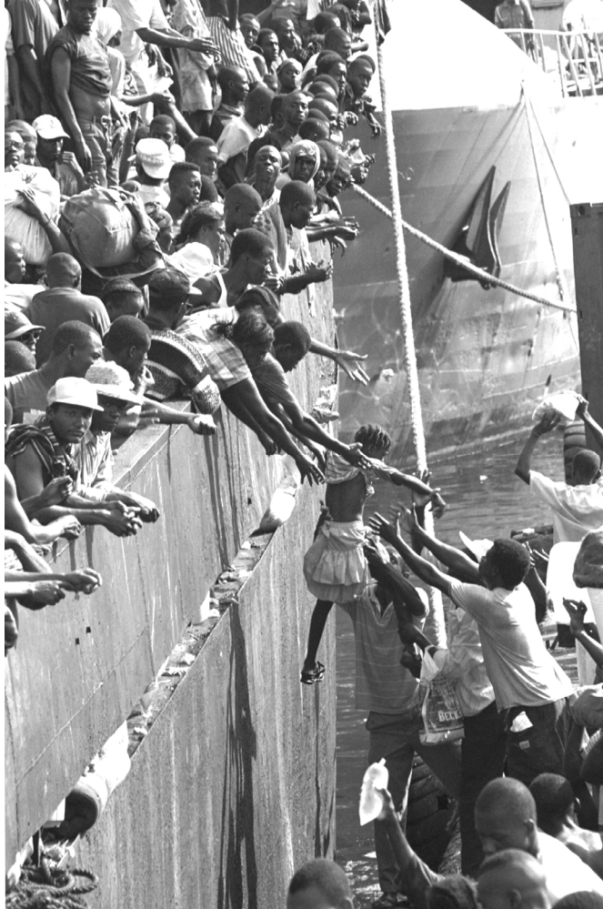
Thousands of frightened Liberians struggle to board a ship in the Freeport of Monrovia in May 1996 to escape heavy fighting between forces from the NPFL and ULIMO-K. The fighting from April – May 1996 resulted in heavy civilian casualties.

Massive looting also took place when the RUF and Liberian government troops attacked Guinea in 2000. An operational commander with the Liberian Jungle-Fire militias explained: