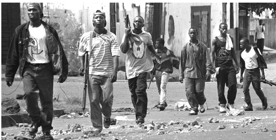
Combatants with the NPFL patrol through the streets of Monrovia in April 1996. Clashes between forces from the NPFL and ULIMO-J during April and May 1996 left hundreds of civilians dead and thousands more wounded. Many Sierra Leonean fighters fought with both the NPFL and ULIMO-J.

Individuals involved in the recruitment of regional warriors interviewed by Human Rights Watch were typically former commanders from the original armed group of the individual regional warrior. However, those involved in recruiting for the LURD, MODEL, and several Ivorian rebel groups also approached fighters who had previously fought with their enemies. The recruiters understood that, for most potential recruits, the association with their first armed group was not based on any particular political or ideological commitment. Therefore, the recruiters did not expect the recruits to have any such commitment to a future group. In fact, many combatants described switching allegiances in the conflict in their own country, and did so when fighting abroad as well.