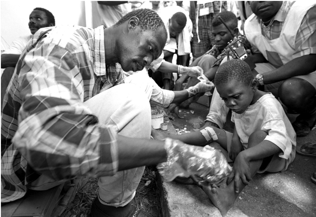
Wounded civilians are treated in a make-shift clinic in the Liberian capital Monrovia in April 1996. Thousands of civilians were wounded and hundreds killed in April and May 1996 when forces from the NPFL and ULIMO-J fought for control of key areas of the Liberian capital.

legitimate accountability process. The exception is the Special Court for Sierra Leone, created by the United Nations through an agreement with the government of Sierra Leone which indicted thirteen of those “who bear the greatest responsibility” for serious violations of international humanitarian law and certain violations of domestic law committed in Sierra Leone since November 30, 1996. 61 Prosecution is on-going for nine of the original 13 defendants, including three leaders from the CDF 62 , three from the RUF 63 , and three from the AFRC 64 . Two of the remaining four indictments – for RUF leaders Sam Bockarie and Foday Sankoh – were withdrawn after both died. Former AFRC leader Johnny Paul Koroma’s whereabouts are unknown; and Charles Taylor is “not in the custody of the Court.” 65