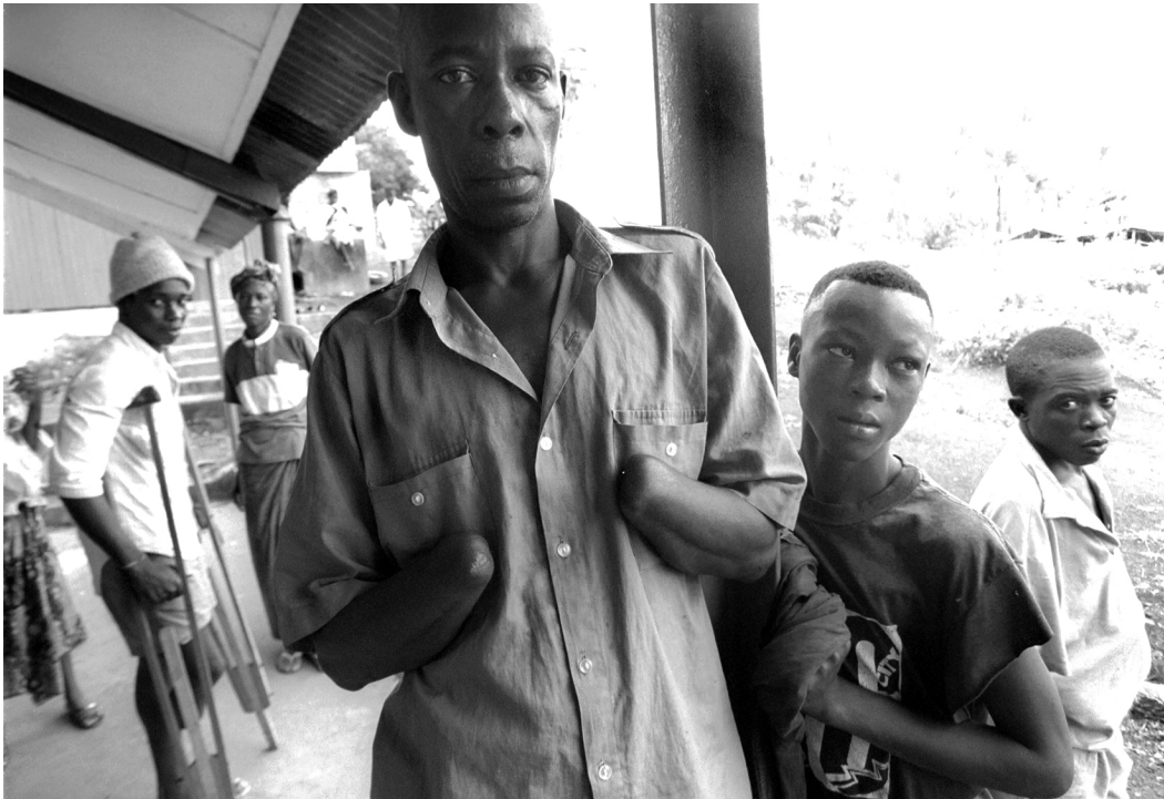
Civilians whose hands were amputated during the RUF/AFRC rebel offensive against the Sierra Leonean capital Freetown in January 1999 wait for medical attention outside a clinic in Freetown in June 1999. Many Liberian fighters took part in the devastating offensive which left several thousands civilians dead.

situation and at the same time made them more vulnerable to exploitation, recruitment and violence. 60