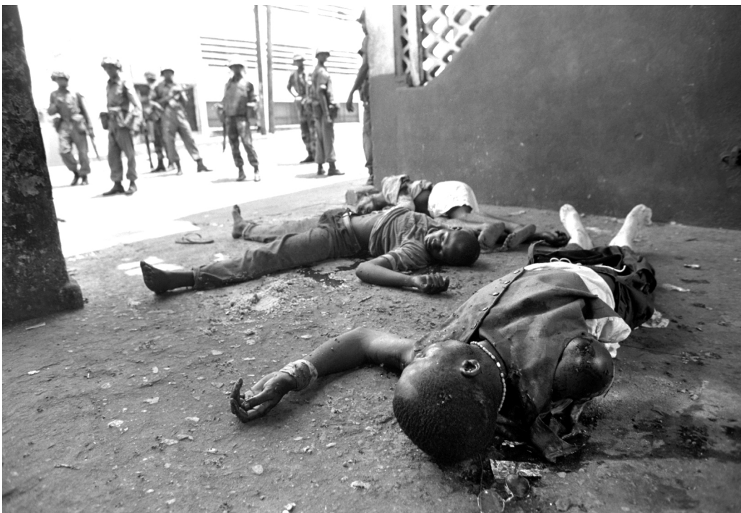
Nigerian peacekeepers patrol by the bodies of several NPFL fighters who were killed during clashes with ULIMO-J during two months of clashes between the two groups in April – May 1996. Hundreds of civilians were killed and thousands more wounded during the fighting.

Dating back as far as the mid 1980's, state and non-state actors in Liberia, Sierra Leone, Guinea, Côte d'Ivoire and Burkina Faso had shown a ready potential to support rebel insurgencies aimed at destabilizing their neighbors. At one time or another, the governments of every one of these five countries has provided financial backing, arms and ammunition, training, logistical support to and even served as a staging base for armed insurgencies which they used as proxies for the purpose of destabilization, resource exploitation or in retribution for political or military policies of their neighboring countries. 12