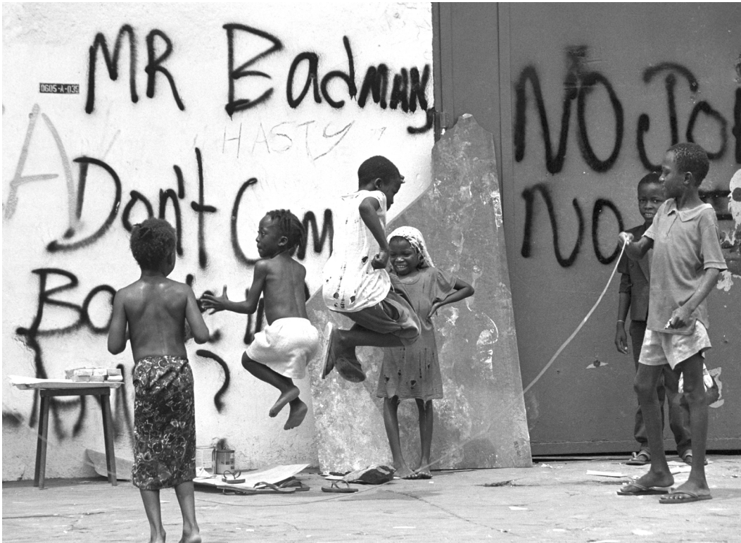
Liberian children jump rope during a lull in the fighting which engulfed the Liberian capital Monrovia in April 1996. Hundreds of civilians were killed and thousands more wounded during the 1996 clashes between Charles Taylor's NPFL and Roosevelt Johnson's ULIMO-J.

There is a significant possibility that many who registered were never, in fact, combatants: only 150 rounds of small arms ammunition (SAA) were needed to enter the program. 107 The screening for adult fighters was less stringent than the corresponding process for child fighters; consequently 70-80% of the SAA entries were adult males. 108 There were considerable inconsistencies in enforcement of the eligibility criteria for DDDR, particularly in the screening processes conducted by MILOBS and NGOs. 109 These eligibility criteria were flexible in the beginning and were never thoroughly reviewed, damaging the credibility of the program. 110