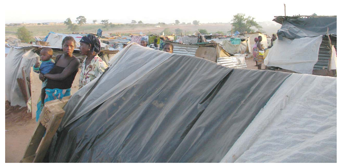
Evictees from Cambamba II living in shacks after a series of eviction operations that demolished their original homes.

The provincial government gave empty land plots in relocation areas to some evictees from Onga. These evictees affirmed they did not receive any construction material to build new houses to replace the demolished ones, or for the construction of emergency shelter. They lived for months in shacks while saving money to build: