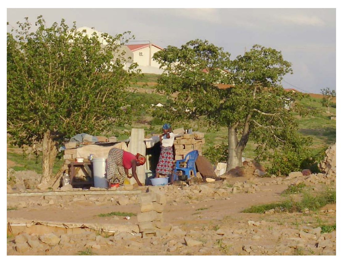
Evictees at the Cambamba I eviction site.

They arrived and didn't talk to anyone...and they pushed down the houses...There was time for nothing...we couldn't take anything out. They broke my bed, my oven; they ran over everything. I tried to do something and they took me. I was trying to get my stuff out and they threw me in the police car...I had a brick house.<sup>72</sup>