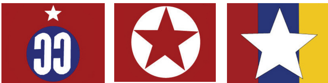
The insignia of the 11th LID, Rangoon Army Command, and the Burmese Police Forces.

The operational cooperation between various military and police units as well as the various militias in downtown Rangoon during the crackdown is clear from media footage and corroborated from several eyewitnesses interviewed by Human Rights Watch. To clear streets, a line of lon htein riot police would form armed with batons and shields, backed up by a line of Burmese army soldiers which would follow behind, directed by an army captain or major with radio communication. 247 After a five-to-ten minute warning relayed by loudspeaker, the riot police would advance until protesters were dispersed. In some cases, baton charges, replete with tear gas, rubber bullets, live fire, and beatings of civilians were used to clear streets. Regular army units were predominantly the units who fired weapons with live ammunition.