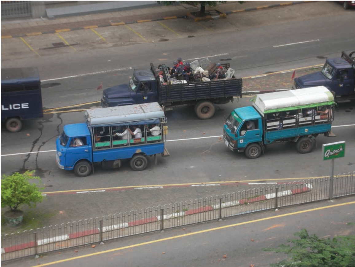
Police and Swan Arr Shin members in commandeered vehicles arrive in downtown Rangoon to assist in the crackdown on September 27, 2007.

During the crackdown in Rangoon, Dyna car drivers (a form of public transport, a truck with benches on the back) were coerced into providing transport to Swan Arr Shin and USDA members, who also used the Dyna cars to transport detained protesters to detention centers.