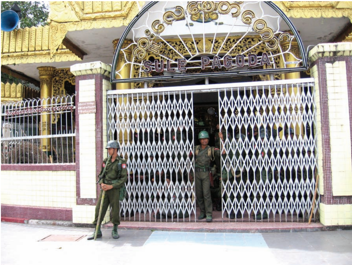
Soldiers of the 66th LID guard the entrance to the Sule Pagoda during the September crackdown.