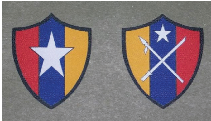
The insignia on the left is the Burmese police from Rangoon Command, the insignia on the right belong to the Lon Htein riot police.