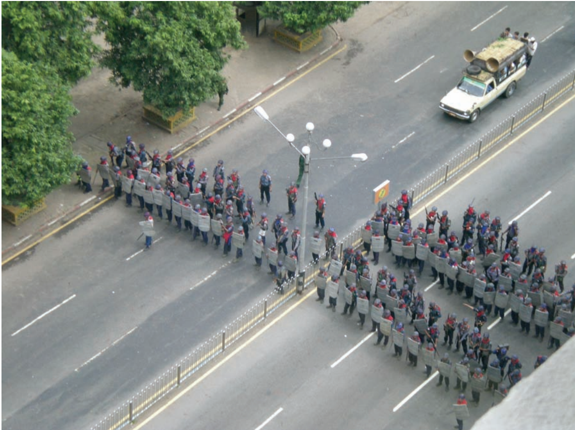
Riot police near the Sule Pagoda with Swan Arr Shin members prepare to charge protesters on September 27, 2007.

Aung San Road onto Sule Pagoda Road, approaching the crowd slowly from the north. 155 The vehicles were accompanied by riot police on foot, banging their batons on their shields apparently in an attempt to scare the crowd. 156 Riot police with shields, teargas, and rubber bullets also stood in formation at the other end of the crowd, at the base of the Sule Pagoda, with 66 th Light Infantry Division soldiers behind them.