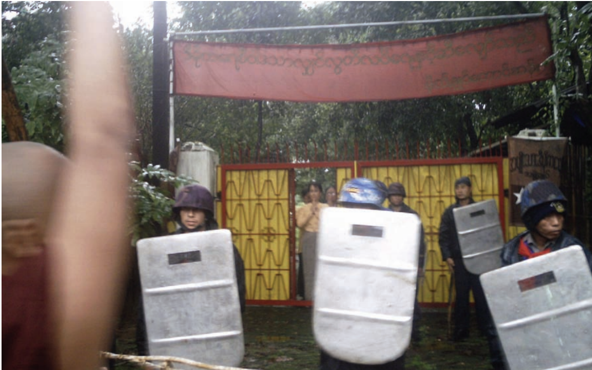
Burma's opposition leader, Aung San Suu Kyi, pays obeisance to monks chanting prayers in front of her residence in Rangoon on September 22, 2007.

The sight of Suu Kyi invigorated the protesters: this was the first time in four years that she had been seen in public, and suddenly a stronger political dimension had been added to the protests. Some thought that change was finally within the realm of the possible. 81 “U Pauk,” a 30-year-old monk who was present at the meeting described to Human Rights Watch what happened that day, and the significance of the meeting: