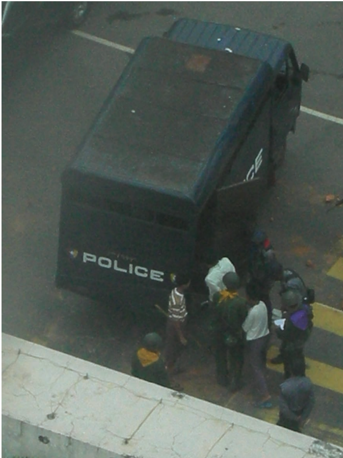
Security forces arrest protesters in downtown Rangoon, September 27, 2007.