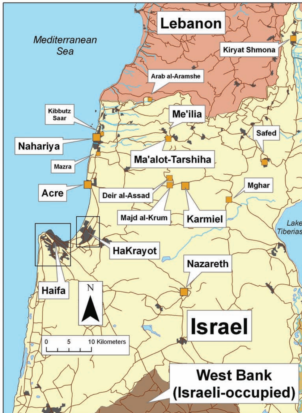
Northern Israel, showing locations struck by Hezbollah rockets that are described in this report.