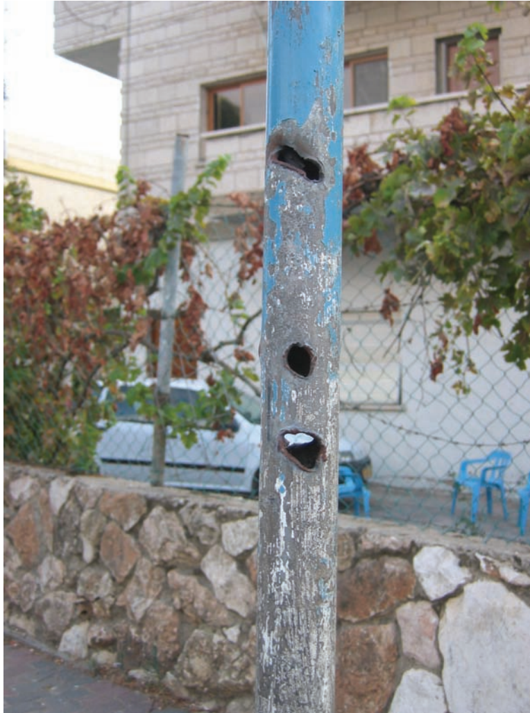
A pole on a sidewalk in Majdal Krum that was penetrated by steel spheres and shrapnel from a rocket that landed on the street nearby on August 4, 2006, killing two men.

Visiting the site of the attack on September 30, Human Rights Watch saw a filled-over hole in the street that Hussein said the rocket had caused, as well as shrapnel damage on nearby poles and street signs.