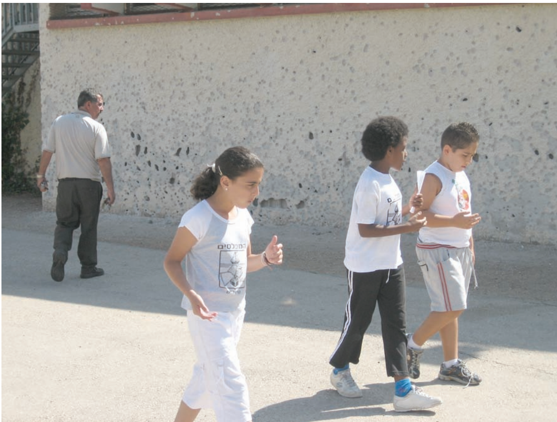
A wall of the elementary school “HaMiflasim” in Kiryat Yam, damaged by steel spheres from a rocket that hit an adjacent classroom on August 13, 2006.

Hezbollah provided no specific information about its attacks on Kiryat Yam or its intended targets there; it has not replied to Human Rights Watch requests for information about these attacks.