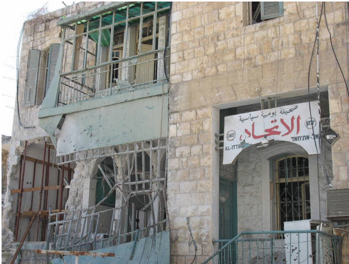
A building in the Wadi Nisnas neighborhood of Haifa, housing the archives of al-Ittihad newspaper, after a rocket struck on August 6, 2006, killing two elderly persons next door.

If Hezbollah had indeed been targeting military or industrial objects in Haifa some of the time, it expressed no regret for the civilian casualties it was inflicting until its rockets first hit the majority-Arab neighborhood of Wadi Nisnas on August 6, killing two residents and seriously wounding a third. It was then that Hezbollah secretary-general Nasrallah went on television to urge Arab residents to leave the city. (See chapter below on “Hezbollah’s Justifications for Attacks on Civilian Areas.”)