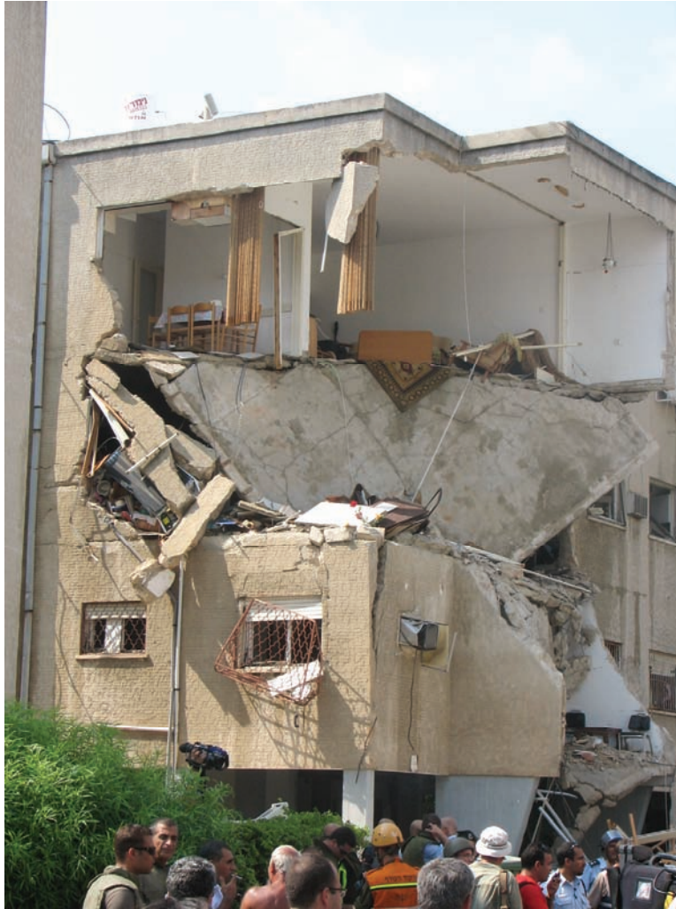
A rocket hit this apartment building in the Bat Galim neighborhood of Haifa on July 17, 2006, wounding six residents.

Haifa Police Chief Meri-Esh believes Hezbollah was aiming mostly at targets in the port area and that the relatively few rockets that reached the upper city were “over-shots.” The problem is that between the port area and the more affluent upper city neighborhoods on the hill are the lower residential neighborhoods, some densely populated. Thus, if Hezbollah was in fact trying to hit objects on the waterfront, its inaccurate rockets, flying a distance of thirty kilometers, stood a good chance of striking—and did indeed strike—residential and shopping neighborhoods just beyond.