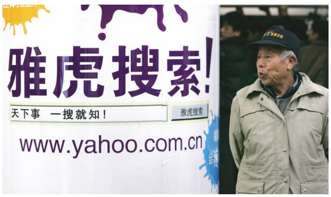
A man stands next to a poster advertising US internet search engine Yahoo in a Beijing subway station.

This category of rights encompasses rights to personal and political liberties.<sup>38</sup> It includes, among others, the right to liberty of the person (including freedom from arbitrary arrest and detention), freedom of peaceful assembly, freedom of opinion and expression, freedom of information, freedom of movement, freedom of religion, the right to property, the right to found a family, and the right to privacy.<sup>39</sup> Contrary to the commonly held view that business activities have little to do with civil and political rights, these rights frequently have been affected by companies in a variety of contexts, as shown in various Human Rights Watch reports.