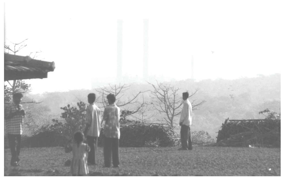
Residents of Katalwadi village in India stand near Enron's Dabhol power plant (in the background). When some villagers protested against the power plant, contractors for the company and police retaliated against them.

Victims of human rights abuses are entitled to an effective remedy that offers redress for the harm suffered. This can encompass, among others, the right of access to courts, the right to a fair trial, the right to equal protection under the law, the right to seek reparation and satisfaction, and the right to enforcement of judgments.<sup>97</sup>