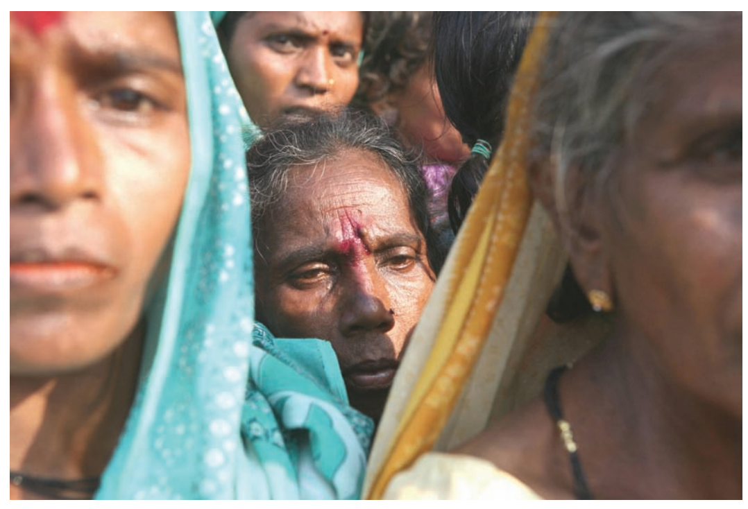
Dalit women honor the late Dr. B. R. Ambedkar, who spent his life fighting "untouchability" and other forms of caste discrimination.

All human beings are entitled to fair and equal treatment and freedom from discrimination. The prohibition against discrimination applies in respect of all rights. It encompasses discrimination on the basis of gender, race, nationality, or other status.