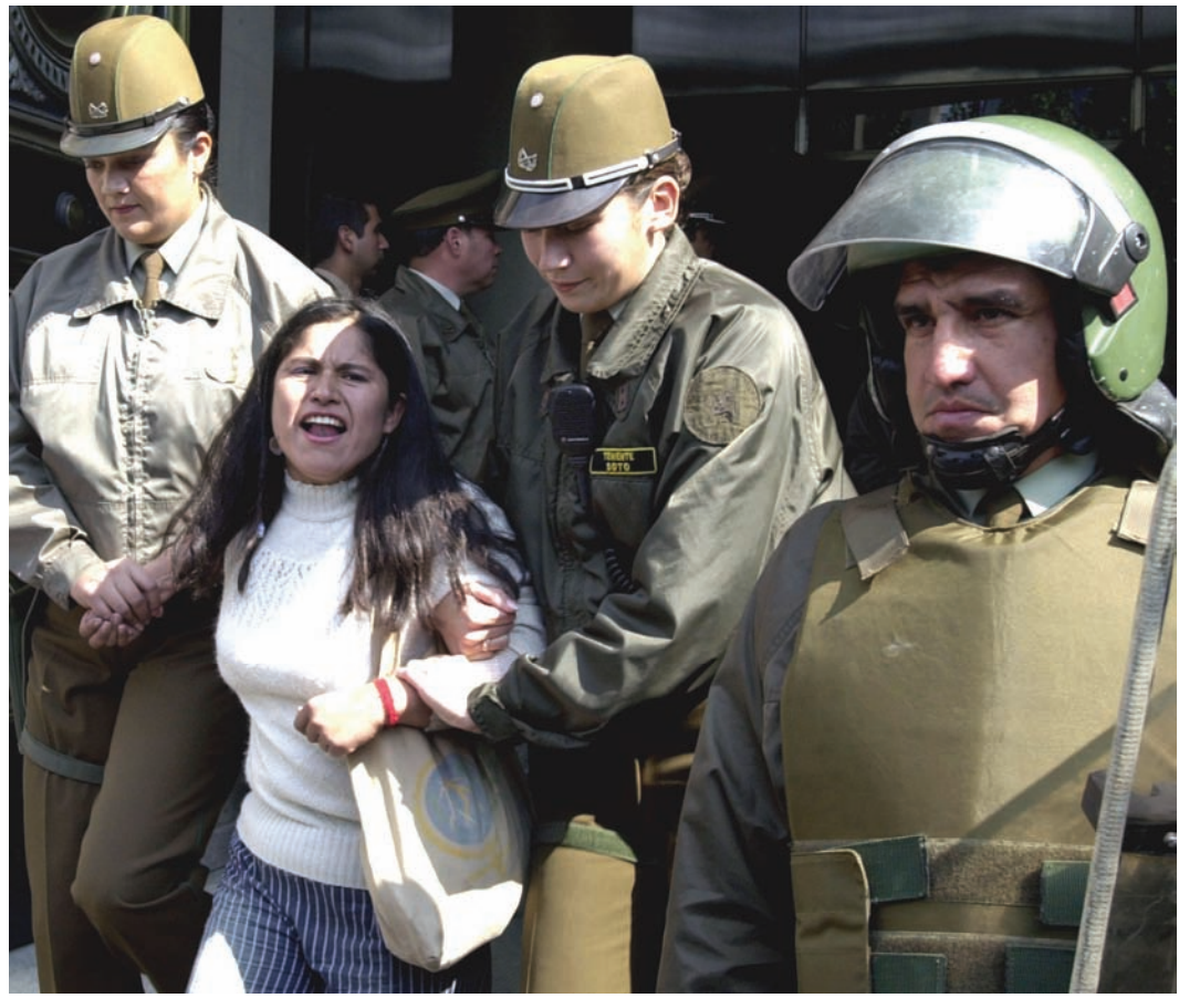
Police detain a demonstrator during a protest in downtown Santiago against a project to build a hydroelectric plant on land in southern Chile owned by Mapuche Indians.

This category addresses the rights that members of certain groups hold jointly, by virtue of their shared membership in a community. Human rights principles, as noted previously, can provide special protections for those who may be particularly vulnerable due to their social, economic, or cultural marginalization. Whereas in some cases these rights are exercised by individuals in their capacity as members of a group—such as is the case for migrants or children, for example—in other cases the rights are by their nature collective rights enjoyed by a community as a whole. This category is concerned with the latter set of rights and in particular addresses the rights of groups such as indigenous peoples.<sup>88</sup>