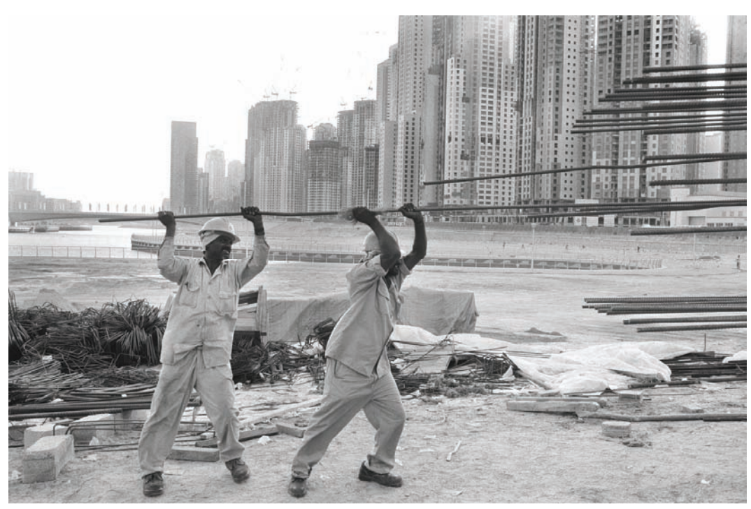
Foreign laborers work to build the Jumeirah Beach luxury apartment complex in Dubai, United Arab Emirates.

Labor rights encompass the right to work as well as the enjoyment of rights at work. International law recognizes four "core" labor rights: freedom of association and the effective recognition of the right to collective bargaining; the elimination of all forms of forced or compulsory labor; the effective abolition of child labor; and the elimination of discrimination with respect to employment and occupation.