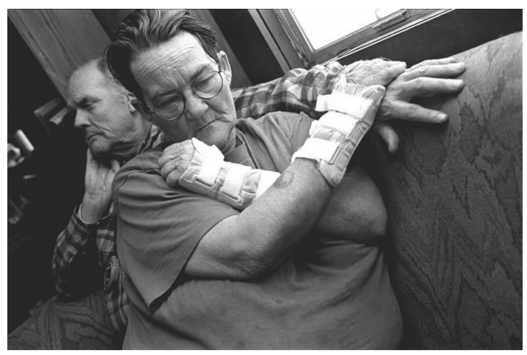
An injured meatpacking worker at home with her husband. The serious injury rate in the meatpacking industry is about five times the national average, making it the most dangerous job in America.

Economic and social rights<sup>22</sup> relate to the right of all humans to the basic necessities of life, including but not limited to food, water, social security, clothing, health care, education, and housing.<sup>23</sup> Businesses have affected this category of rights in myriad ways.