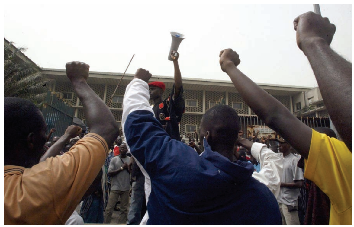
Young Patriots and members of the Students Federation of Côte d'Ivoire (FESCI) demonstrate on March 9, 2004 in front of the Abidjan courthouse in a protest against the nomination of new judicial authorities.

soon freed on the initiative of the chief public prosecutor ( procureur de la republique ), Sékou Goba, who was subsequently suspended by then serving Minister of Justice Henriette Diabaté, currently a leader of the RDR opposition party.<sup>180</sup> In retaliation, the following month hundreds of members of FESCI and the Young Patriots youth militia surrounded the Palais de Justice in downtown Abidjan to protest the swearing in of two judges, including the president of the Abidjan Court of Appeals, who had just been named by Justice Minister Diabaté.<sup>181</sup>