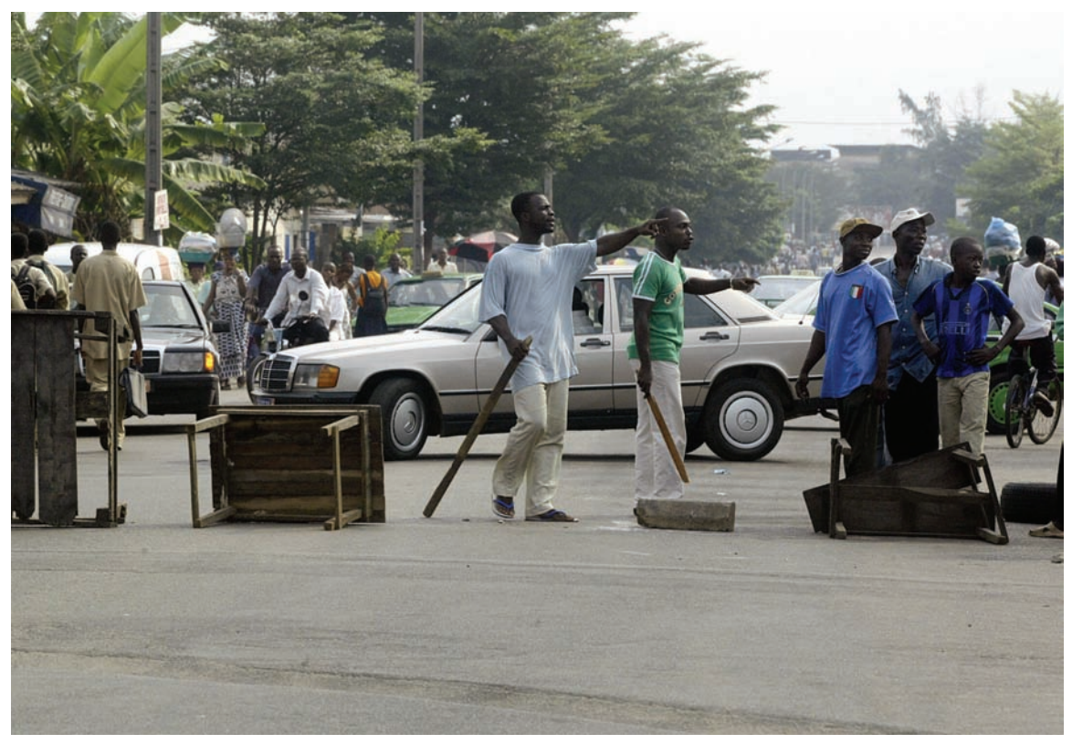
Pro-government youth set up a barricade on January 17, 2006. Hundreds of similar roadblocks were erected throughout Abidjan.

rocks, burning tires, taking control of the national television station,<sup>154</sup> and attacking vehicles and premises of the UN and international humanitarian agencies, resulting in heavy material losses. The violence and associated incitement forced temporary retreat of some 400 UN and humanitarian personnel from parts of western Côte d'Ivoire.<sup>155</sup>