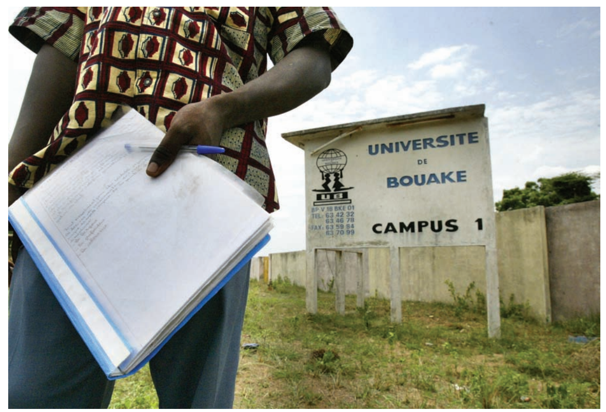
A student holds a folder outside Bouaké University in March 2006.

From the outbreak of civil war in September 2002 until March 2006, the university in the rebel capital of Bouaké was officially closed. Though most students fled to the relative safety of Abidjan, the Bouaké campus was watched over by a small group of students living on campus, some of whom came to call themselves the "Student Committee."<sup>200</sup> Students managed to survive on proceeds from selling ice and a few donations from French peacekeepers, and attempted to prevent the campus's small library from being pilfered by looters.<sup>201</sup>