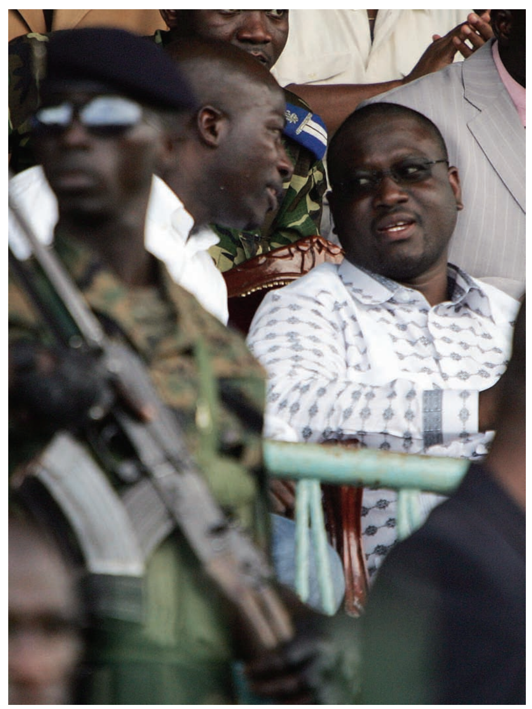
Ivory Coast's Prime Minister Guillaume Soro (R) speaks with the leader of the Young Patriots, Charles Ble Goude (L), during a visit in the western town of Gagnoa, October 20, 2007. Both leaders once served as secretary general of FESCI.

Beyond these "headliners," former members of FESCI are increasingly represented within the administration of different government ministries, and within security forces such as the police and the gendarmerie. Many of those interviewed, from