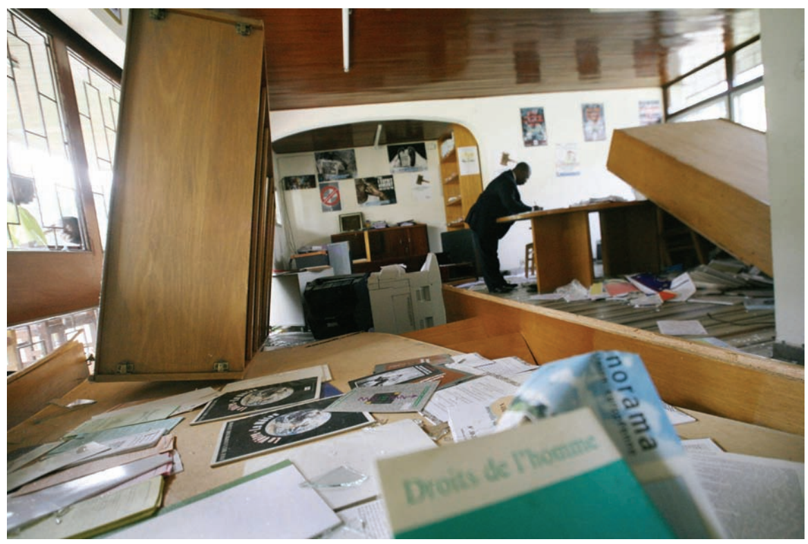
A general view of the Ivorian League for Human Rights (LIDHO) turned upside down by members of FESCI.

Both organizations expressed surprise at the attacks. LIDHO in particular had been a strong defender of FESCI throughout the 1990s when they were persecuted by the government. Both organizations had been involved in attempting to promote peaceful resolution to conflicts on campus and had undertaken initiatives to reduce the incidence of campus violence.<sup>197</sup>