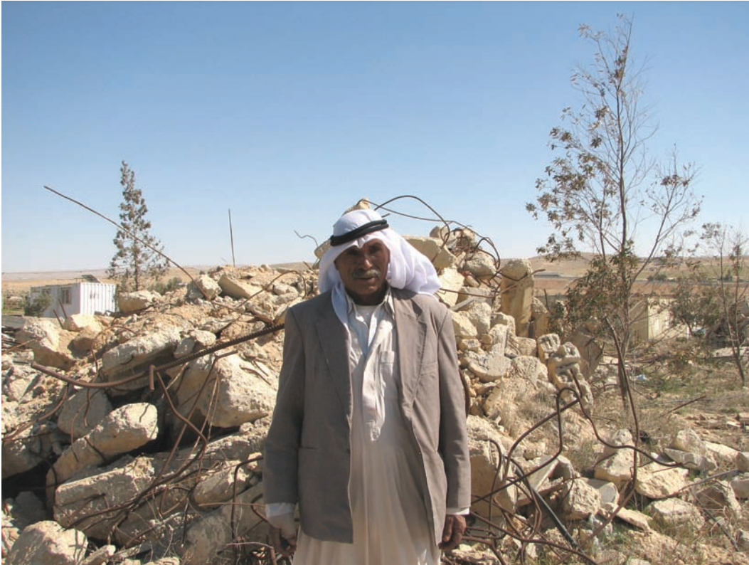
The brother referred to in the above testimony in front of ruins of his house demolished in 1993.

My brother was forced to demolish his house in 1993. The court decision was either a fine and jail or demolish the house himself. My brother had a beautiful house, and it was expensive to build. He had taken loans to build it, and then he had to demolish it. My brother served in the [Israeli] army his whole life and still lost his home. 197