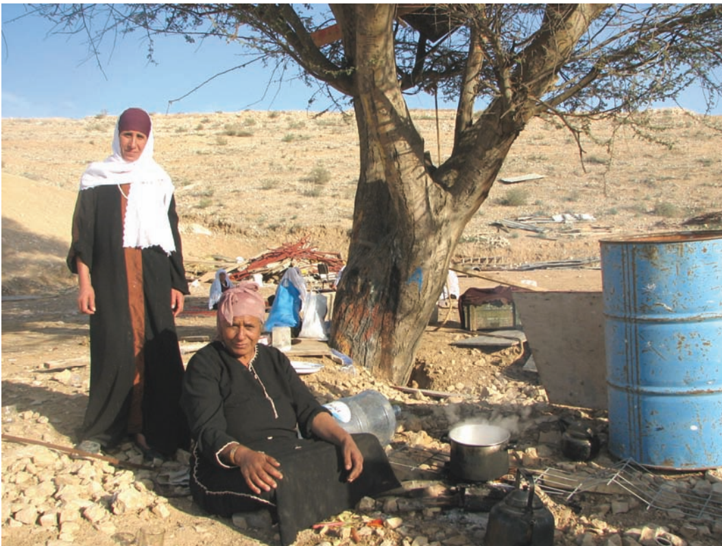
Women in Twayil cook outside after their homes were demolished.

On December 11, 8, 2007, officials from the Israel Land Administration, accompanied by hundreds of police, bulldozers, and trucks, entered the unrecognized Bedouin village of Twayil Abu Jarwal near the Goral junction in the Negev and demolished 20 structures. This was the last of eight times that ILA officials demolished homes of the al-Talalqah tribe in Twayil Abu Jarwal in 2007.