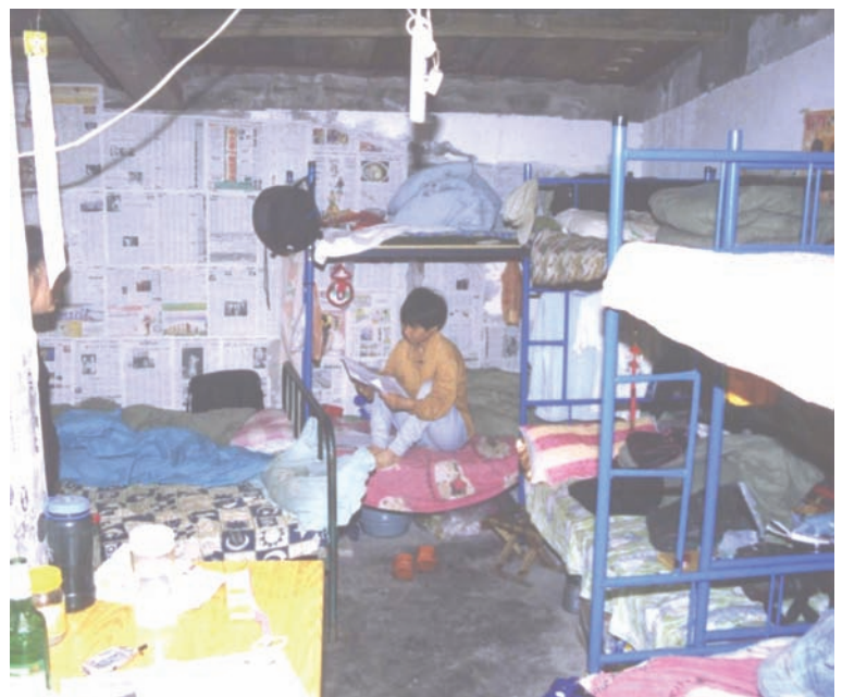
While they wait for their petitions to be addressed in Beijing, petitioners who have the economic resources stay in dormitories in the petitioners' village costing approximately U.S.$1.25 a day.

On arriving in Beijing to pursue their cases, petitioners with some resources may stay at guesthouses near government offices, or in dormitories in the petitioners' village that charge ten RMB [approximately U.S.$1.25] per night. These facilities may be clean, have relatively new beds, and include communal cooking areas.