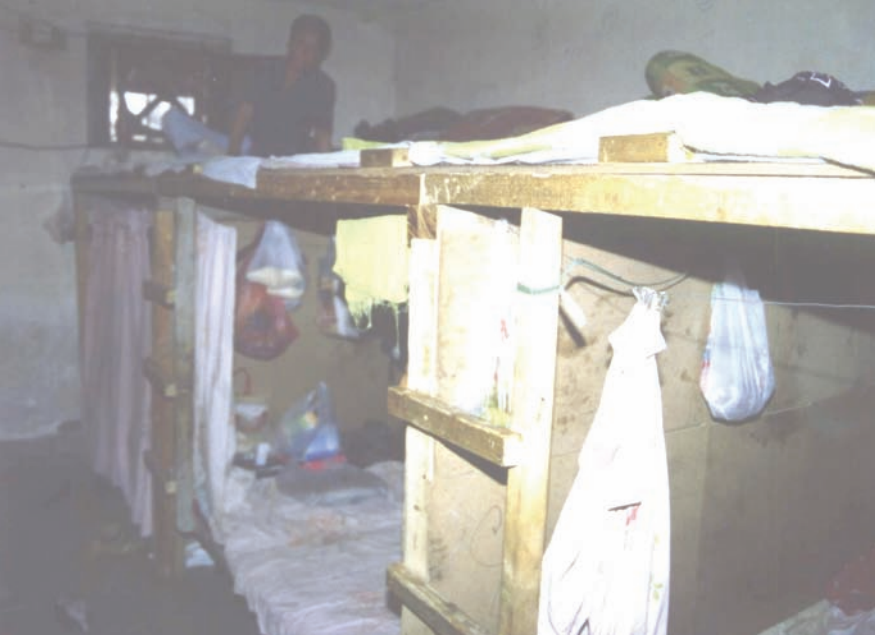
As their finances dwindle, petitioners are forced to move into cheaper and shabbier accommodations.

These rooms are often overcrowded, says an activist: