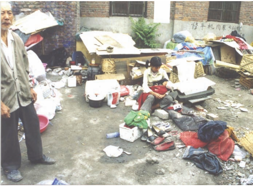
After years of futile attempts at redress, some petitioners wind up living on the streets.

Such petitioners say they suffer especially in Beijing's cold winters. A petitioner named Yang told Human Rights Watch: