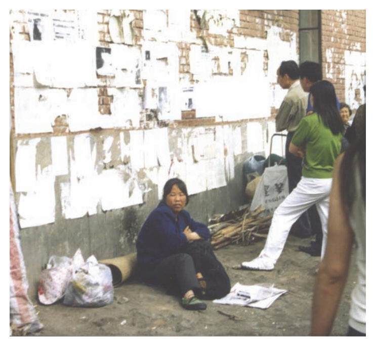
Petitions posted outside the Chinese Supreme Court building in Beijing.

Once in Beijing, many petitioners travel from bureau to bureau, trying their luck at each. One website lists over fifty petitioning offices at various ministries and government organs in Beijing alone.<sup>36</sup> According to the Chinese Academy for Social Sciences survey, petitioners interviewed had visited an average of six different bureaus in Beijing, while some have been to as many as eighteen. These included the National Bureau of Letters and Visits, the State Council, the Supreme Court, the Communist Party Central Disciplinary Commission, the Public Security Bureau, the Supreme People's Procuratorate, the National Bureau of Land Resources, the Agriculture Bureau, and the Civil Administration Bureau.<sup>37</sup>