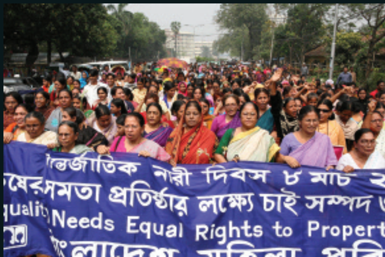
The members of Bangladesh Mahila Parishad, a leading women’s rights organization, attend a rally to mark International Women’s day in Dhaka, Bangladesh on Saturday, March 8, 2008. The banner reads “International Women’s Day rally. Gender equality needs equal rights to property and resource.”

The Bangladesh government has taken small but concrete steps toward law reform recently. This report highlights the demands of women’s rights groups in Bangladesh for law reform and calls on the government to forge ahead with reforms, amend family court procedures, and improve social assistance programs to meet the profound needs of many divorced and separated women.