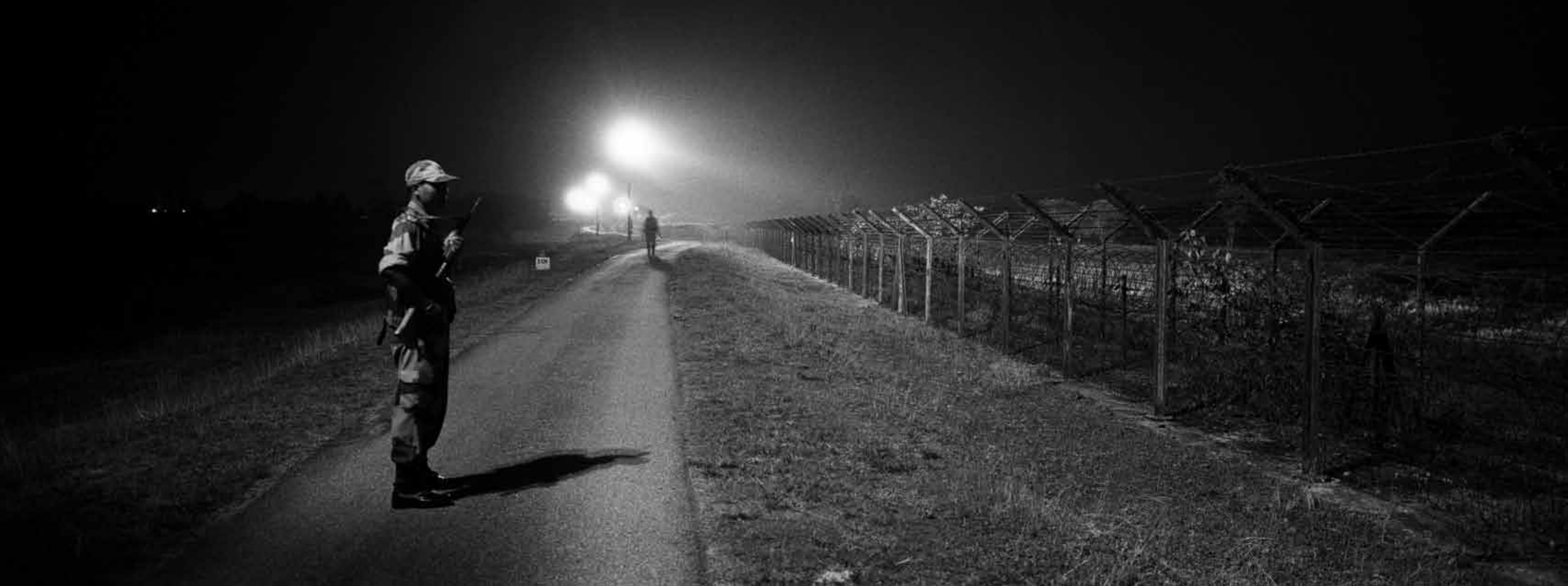
Floodlit sections of the Indian fence in West Bengal, on the border with Bangladesh.