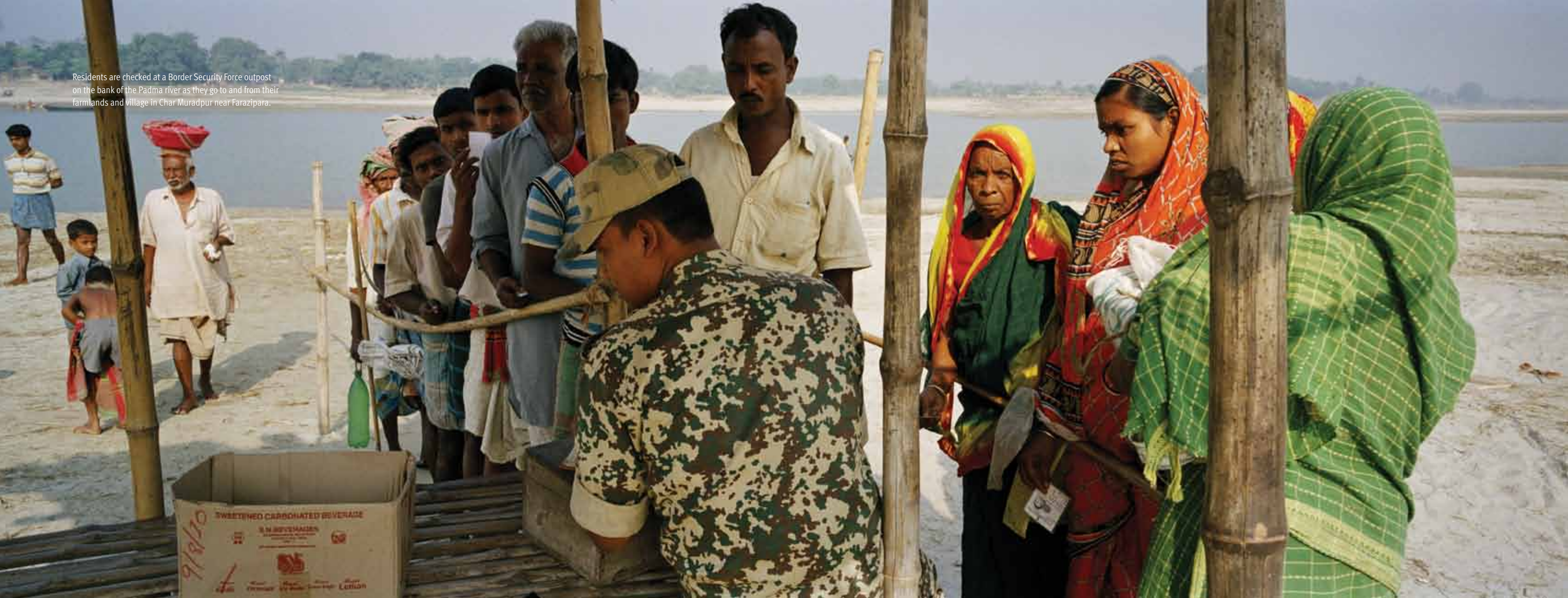
Residents are checked at a Border Security Force outpost on the bank of the Padma river as they go to and from their farmlands and village in Char Muradpur near Farazipara.

Torture is also rife. On January 25, 2010, Motiar Rahman, a Bangladeshi national strayed across the border while cutting grass, a common mistake since there are no clear markers. According to Motiar Rahman, he was captured by two BSF soldiers: