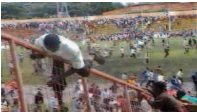
(top to bottom) Security forces near the entrance to the September 28 Stadium in Conakry clash with protestors in this frame grab taken from September 28, 2009 video footage.