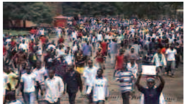
Opposition supporters in Guinea demanding a return to civilian rule march on September 28, 2009, toward Conakry's main stadium.

Outside the main stadium, on the sports complex grounds, many more opposition supporters were shot, knifed, or bayoneted, often to death, as they tried to escape.