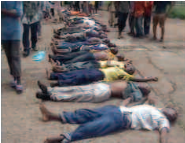
(top to bottom) The body of a victim of the September 28, 2009 massacre is carried away at the entrance to Conakry's main stadium.

This image taken immediately following the September 28, 2009 massacre in Guinea shows bodies of victims lying at the entrance to Conakry's main stadium.