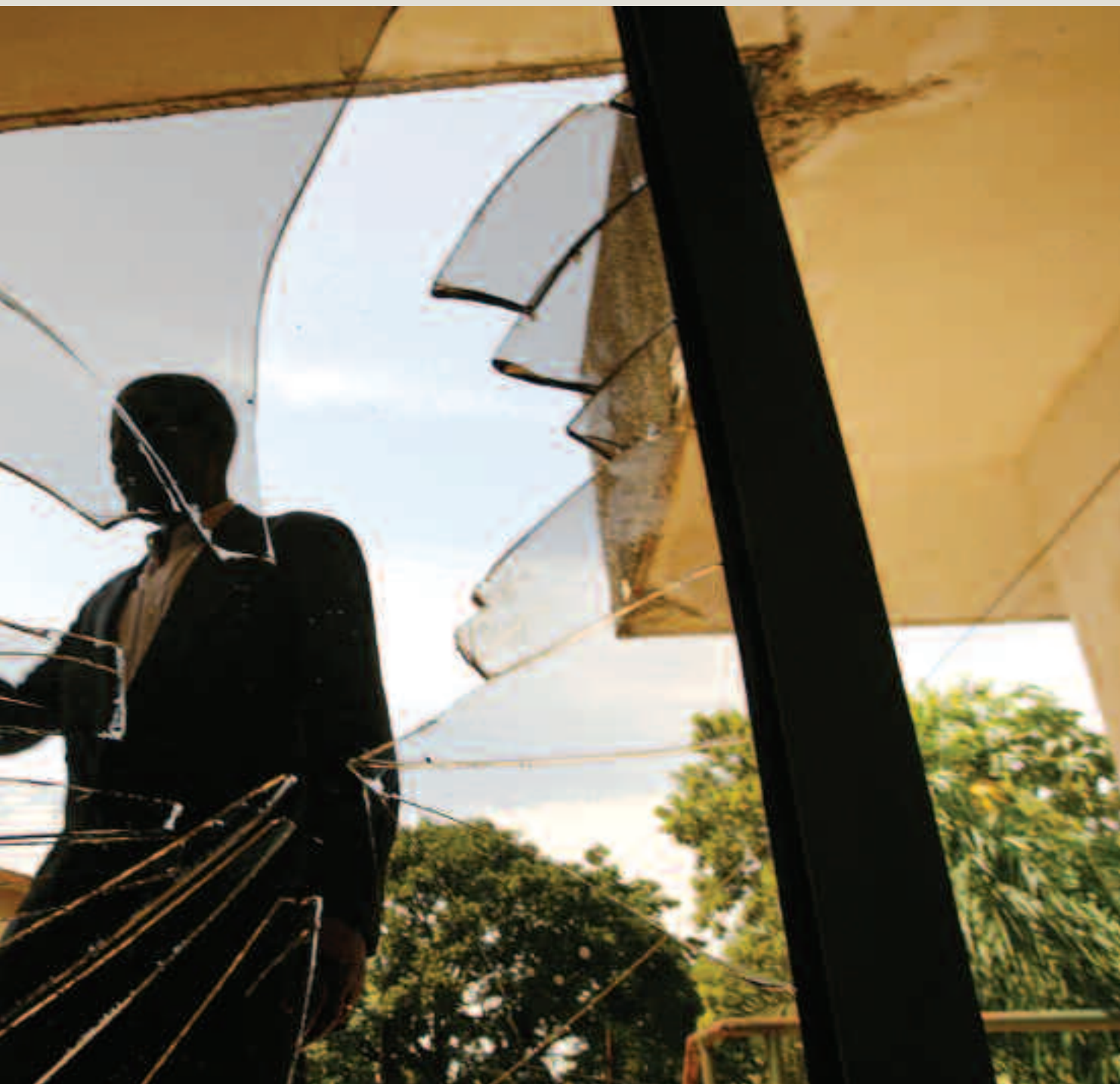
Jean-Marie Doré, head of the Union for the Progress of Guinea (UPG), stands on October 3, 2009, in front of a glass window that was smashed by soldiers during a raid on his home on September 28. The raid occurred several hours after the security forces opened fire on opposition supporters gathered at the September 28 Stadium in Conakry.