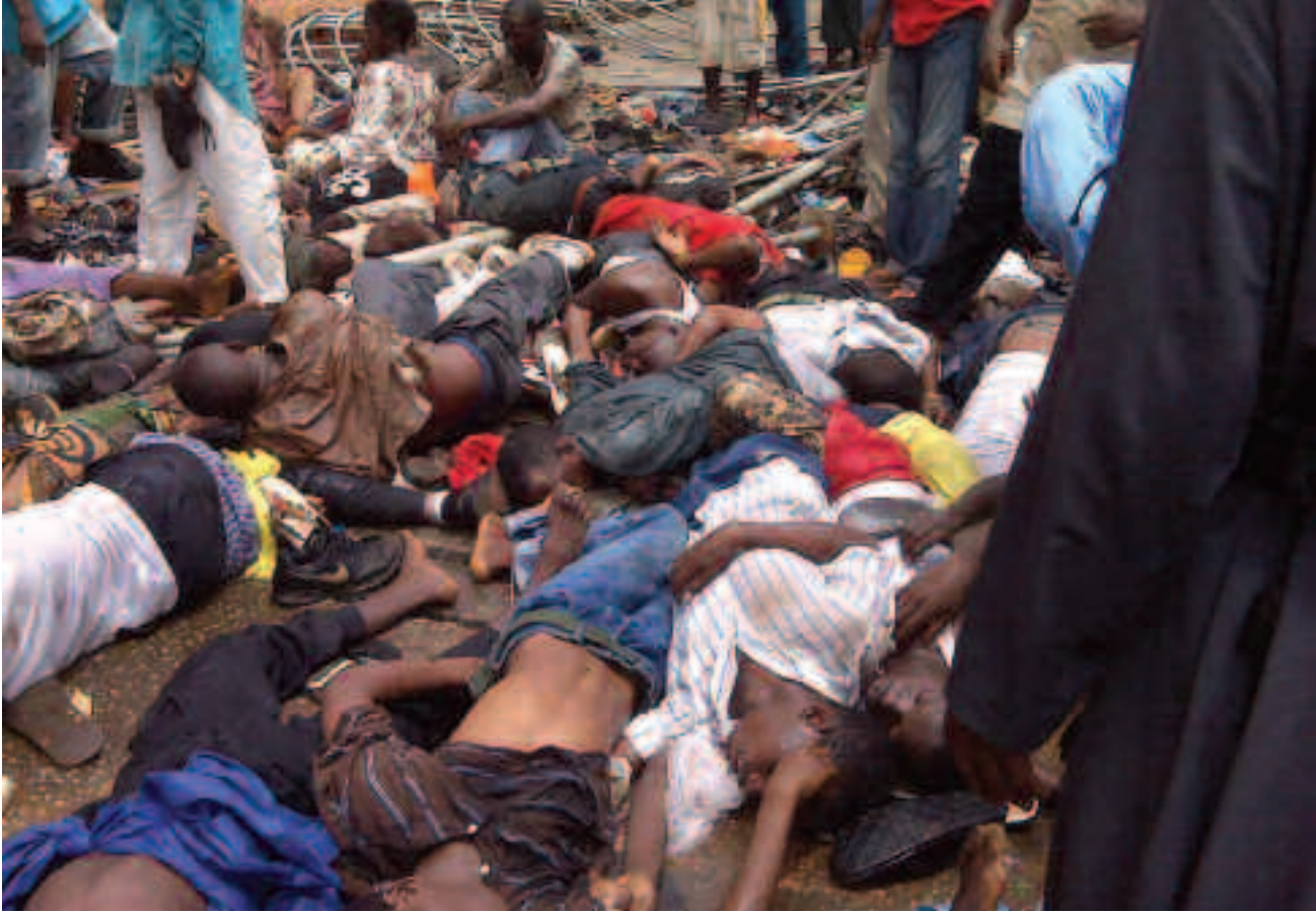
This image taken immediately following the September 28, 2009 massacre in Guinea shows bodies of victims lying at the entrance to Conakry's main stadium.