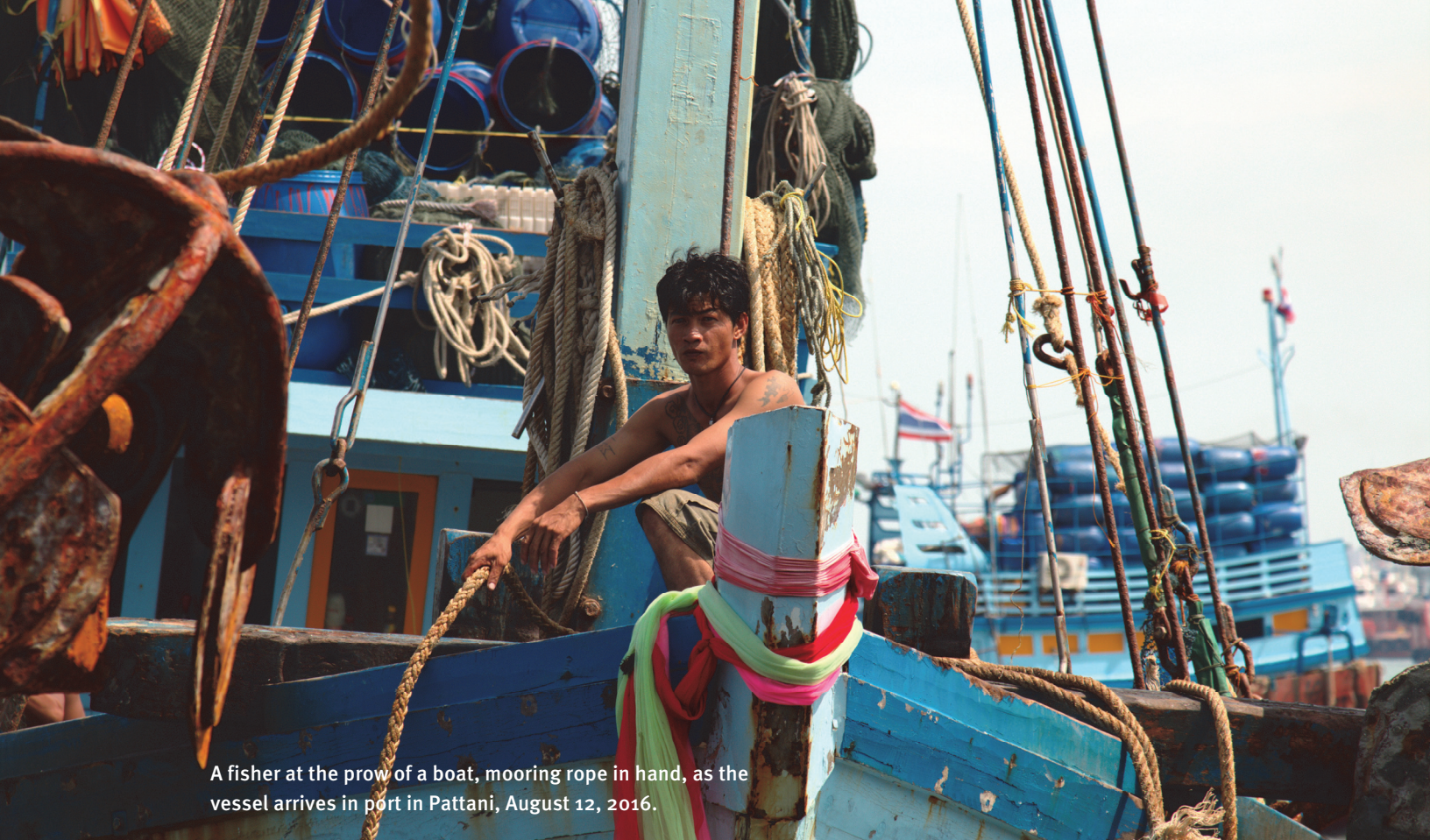
A fisher at the prow of a boat, mooring rope in hand, as the vessel arrives in port in Pattani, August 12, 2016.

sale in the freezers of the world’s top four retailers. 5 Ten days later, the United States Department of State downgraded Thailand in its annual Trafficking in Persons (TIP) report to Tier 3, the lowest possible status. Prompted in part by numerous media exposés that raised serious concerns about killings, beatings, and trafficking of migrant fishers, many from Burma and Cambodia, the European Commission in April 2015 issued a “yellow card” warning to Thailand, identifying it as a possible non-cooperating country in fighting illegal, unreported, and unregulated (IUU) fishing. A subsequent “red card” would lead to European Union sanctions.