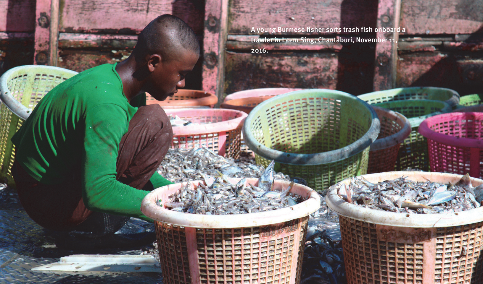
A young Burmese fisher sorts trash fish onboard a trawler in Laem Sing, Chantaburi, November 11, 2016.

Many of the human rights problems in Thailand's fishing industry are common to migrant workers in sectors throughout Thailand's economy, whose exploitation is aggravated, and sometimes caused, by the government's haphazard national policies on labor migration.