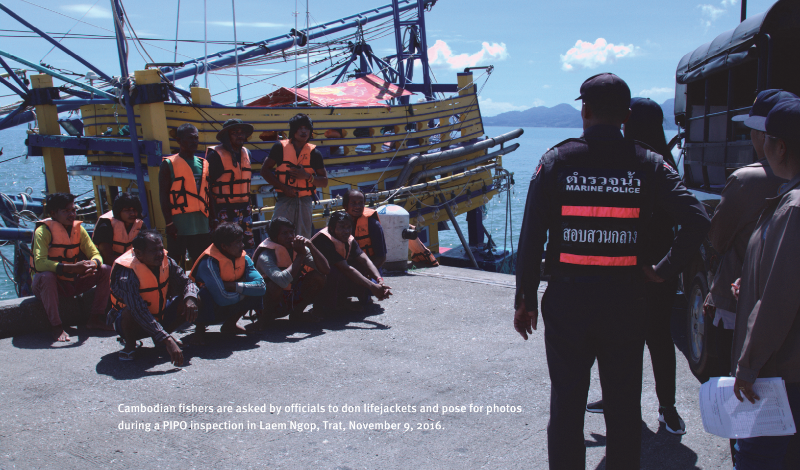
Cambodian fishers are asked by officials to don lifejackets and pose for photos during a PIPO inspection in Laem Ngop, Trat, November 9, 2016.

secured their jobs through similar channels but who are not victims of forced labor, or alongside individuals who can be considered trafficking victims as a result of the way they were recruited.