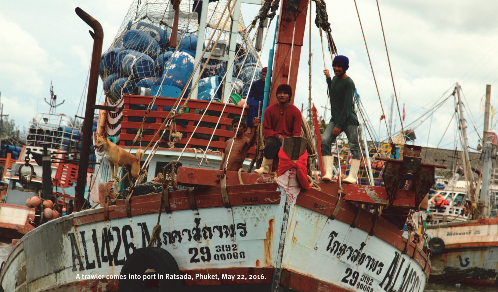
A trawler comes into port in Ratsada, Phuket, May 22, 2016.