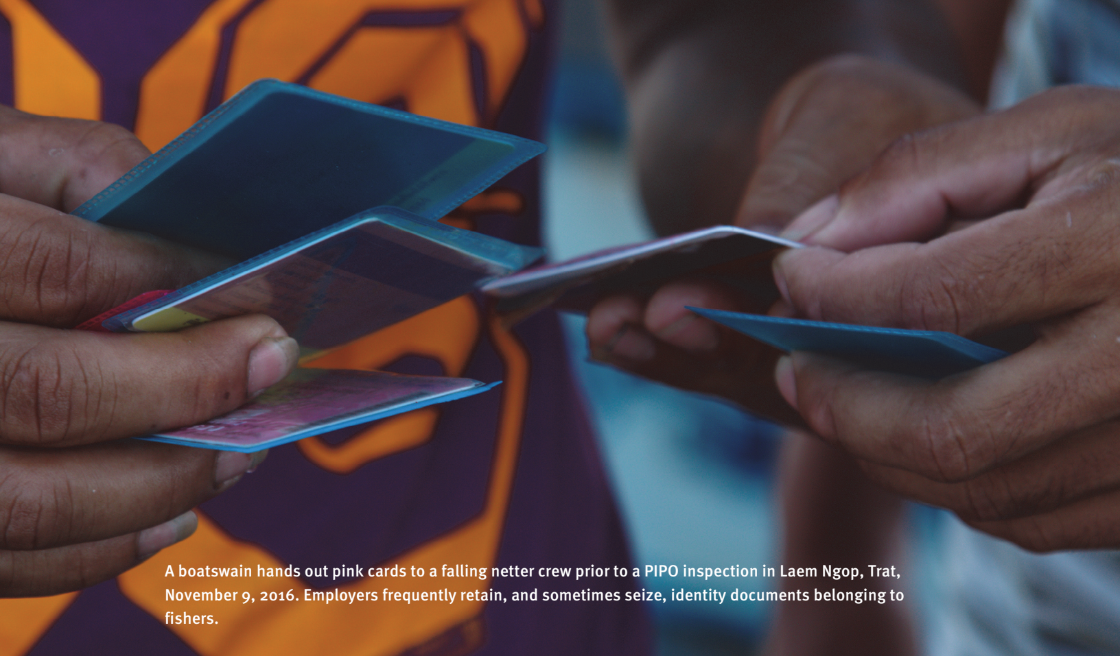
A boatswain hands out pink cards to a falling netter crew prior to a PIPO inspection in Laem Ngop, Trat, November 9, 2016. Employers frequently retain, and sometimes seize, identity documents belonging to fishers.

monitoring and control of workers, ensuring only that the fisher is matched to his pink card and his name appears on the crew manifest for the boat he is on.