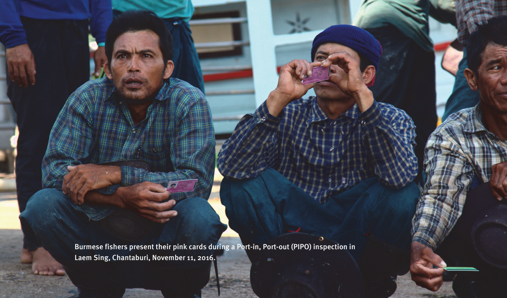
Burmese fishers present their pink cards during a Port-in, Port-out (PIPO) inspection in Laem Sing, Chantaburi, November 11, 2016.

Human Rights Watch research identified 20 forced labor situations in 34 group and individual interviews with fishers, accounting for 90 of the 138 fishers we interviewed who were still employed on boats at the time of the interviews. 6