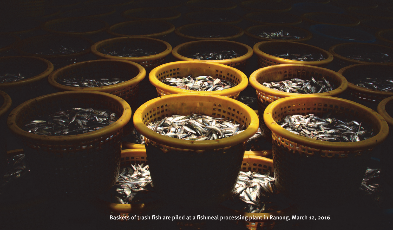
Baskets of trash fish are piled at a fishmeal processing plant in Ranong, March 12, 2016.

government agencies such as the Department of Labour Protection and Welfare and the Department of Employment, which both operate under the Ministry of Labour.