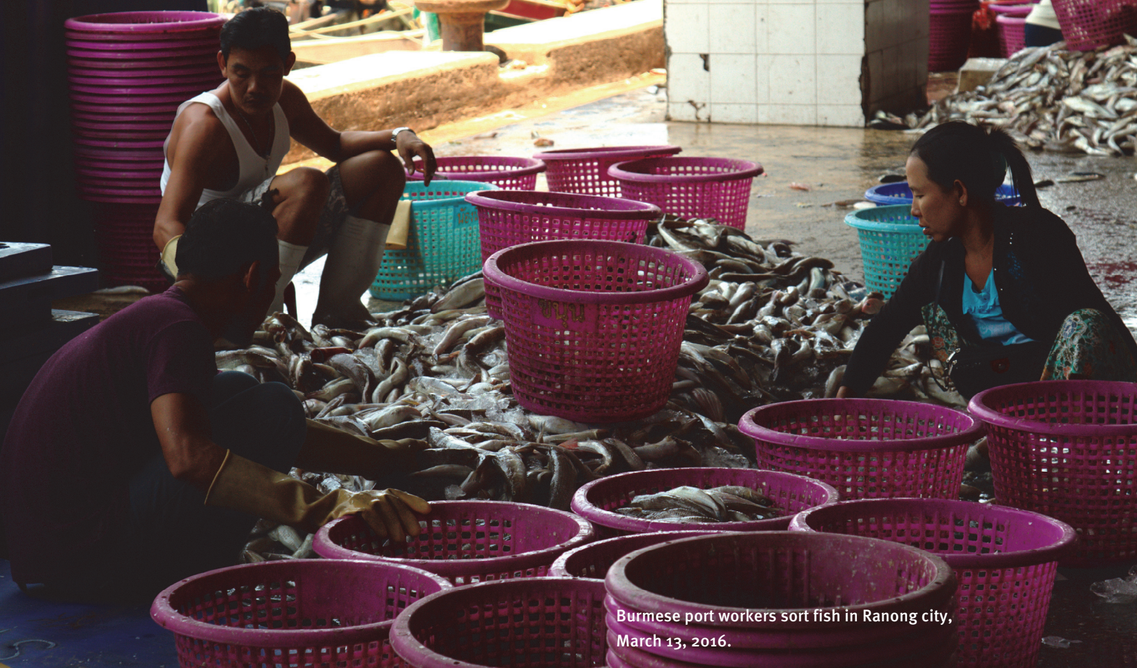
Burmese port workers sort fish in Ranong city, March 13, 2016.

These reforms have focused primarily on establishing control over fishing operations and tackling IUU fishing. Yet they have had little effect on human rights abuses that workers face at the hands of ship owners, senior crew, brokers, and police officers. Meanwhile, the impact of stronger regulatory controls on improving conditions of work at sea has been limited as a result of poor implementation and enforcement.